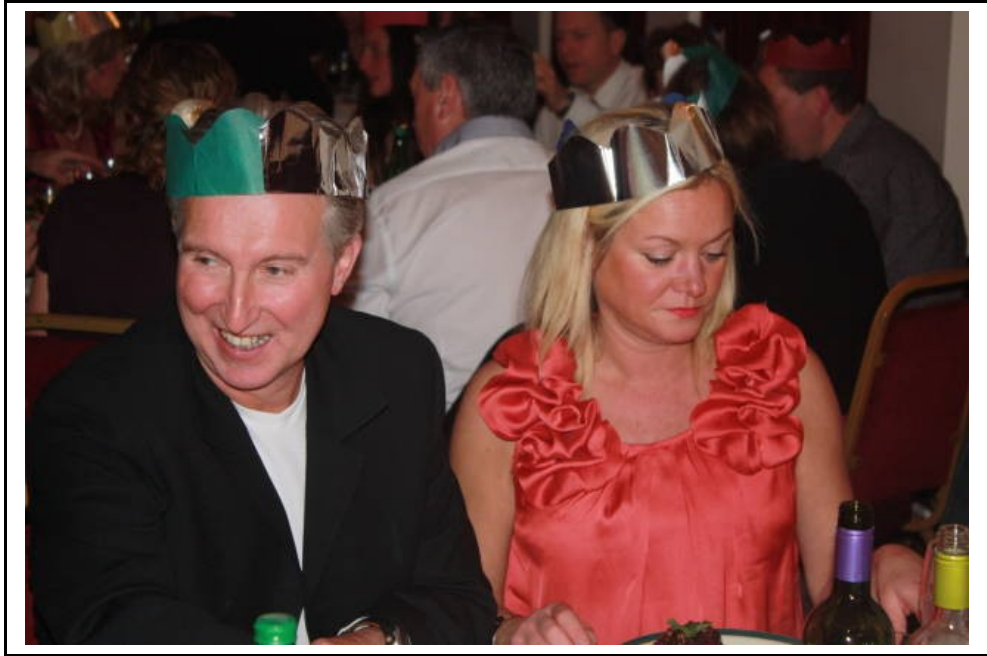
Tim Cook and his better half!