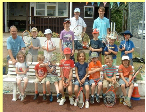
Junior players at the Summer Tennis Camp

We've done it—phase I is complete thanks to generous grants received from several benefactors. We now need to plan and raise funds for phase 2 which includes lighting and a practice wall.