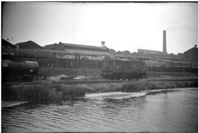
The marshalling sidings that lay to the west of Carterhouse Junction as seen in the late 1960s. The diesel shunter had originally been built by the LMS.

Events are open to non members at a cost of £2.00 per person.