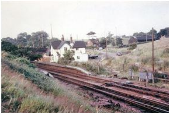
Halton Station as seen looking towards Warrington in 1967.

Halton Station was in a fairly isolated location so it was never very busy. It did not survive long after the Nationalisation of Britain's Railway in 1948 closing to passengers on the 7th of July 1952 and to goods on the 3rd February 1954. The line through the station site is still in use today for goods and passenger services. The Chester direction platform at Halton Station is still extant and the building, although heavily altered, can still be seen. It is in use as a private residence.