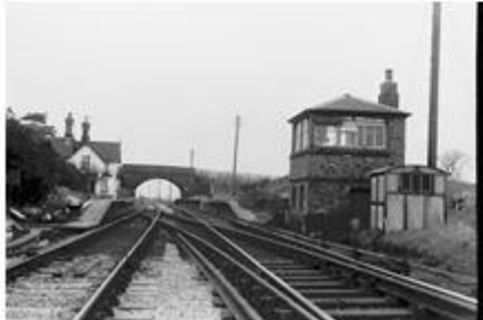
The original Norton Station Signalbox as seen in 1970. At that time the stations platforms were extant.