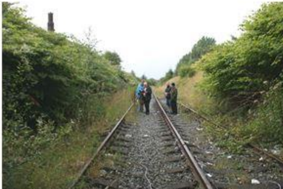
8D Association Members inspect the site of Peasley Cross Station on the 18 th of August 2011.

The summer site visit programme included two visits to sections of the former St Helens & Runcorn Gap Railway. On the 2 nd of June 2011 eight members and two guests walked from a point that would have been to the north of Farnworth & Bold station to just short of the Union Bank Lane bridge adjacent to the M62 Motorway. This section of the line had closed on the 1 st of November 1981 and track lifting commenced just before Christmas of that year. The trackbed is easily walkable as far as Union Bank Lane where it becomes flooded. The sandstone bridge at Bold which was part of the original line was a highlight of the visit.