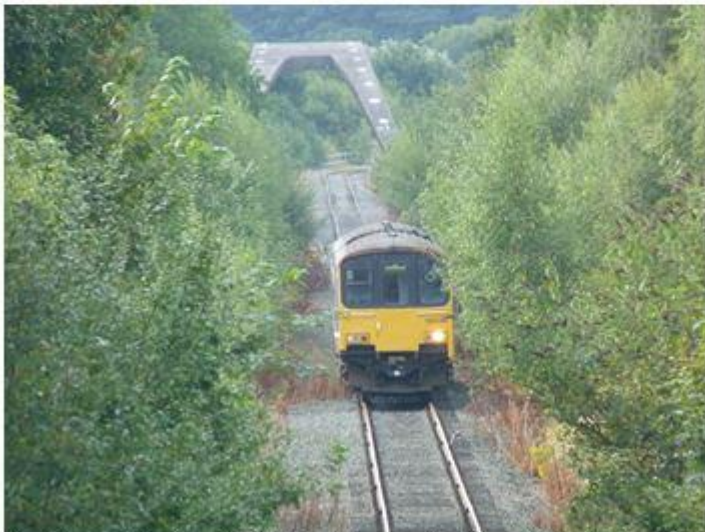
Looking south along the Halton Curve as the Ghost travels along it on the 13 th August 2011

For many years the curve carried a steady stream of express passenger, local passenger and goods trains. A regular stopping service between Liverpool Lime Street and Chester General was still running in the early 1960s and even went over to DMU operation. In 1964 however British Railways reduced service levels and sought to withdraw the service altogether. Consent was refused in 1966 but from the 6 th of March 1967 a revised service was introduced that deliberately destroyed connections and left only a very sparse service in the middle of day. Although supported by a grant in 1969 by May 1973 there were only six passenger trains per day in each direction over the Halton Curve on weekdays running between Runcorn and Chester except for one which ran from Liverpool. A few extra services ran on Saturdays. The service was withdrawn completely with effect from the 5 th of May 1975. Summer only services running between Liverpool Lime Street and North Wales continued to run. They continued into the 1980s but the frequency became less and less.