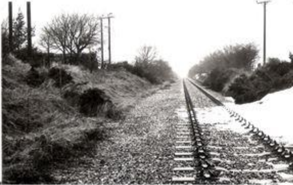
The site of Union Bank Farm Halt as seen in January 1982. Track lifting had begun.

The summer site visit programme included two visits to sections of the former St Helens & Runcorn Gap Railway. On the 2 nd of June 2011 eight members and two guests walked from a point that would have been to the north of Farnworth & Bold station to just short of the Union Bank Lane bridge adjacent to the M62 Motorway. This section of the line had closed on the 1 st of November 1981 and track lifting commenced just before Christmas of that year. The trackbed is easily walkable as far as Union Bank Lane where it becomes flooded. The sandstone bridge at Bold which was part of the original line was a highlight of the visit.