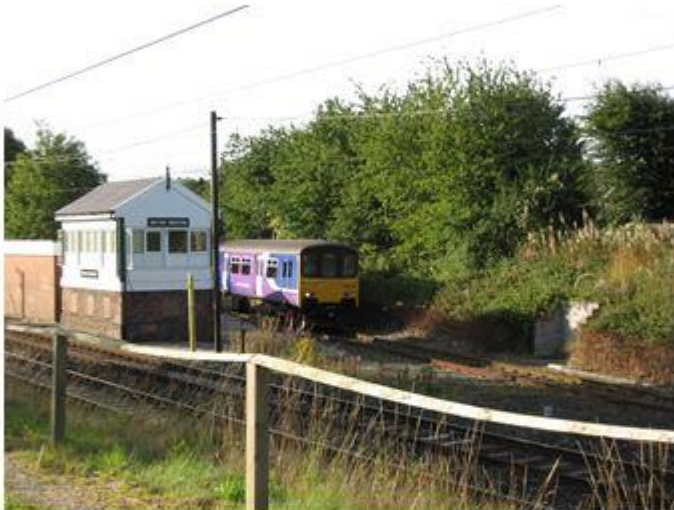
Halton Junction as the Ghost prepares to come off the Halton Curve bound for Runcorn on Saturday the 20 th of August 2011.

The Halton curve was singled in the 1980s. In 1994 points were removed at Frodsham Junction due, it was said, to the cost of replacing them (it was estimated to be £48,000). It was after this date that the Ghost services began. Since that time there has been an active campaign to reinstate the Halton Curve to a bi-directional line. It is a key part of the transport plans of both Halton Borough Council and Merseytravel who want to re-introduce the Liverpool and Chester service. Halton Borough Council has aspirations to create a station on the curve at Beechwood (Runcorn). In 2003 a closure proposal was vigorously fought off.