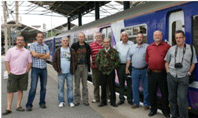
8D association members at Chester Station alongside the 07:53 service to Runcorn on Saturday the 6 th of August 2011.

On Saturday the 6 th of August 2011 ten members and two guests rode on the Chester to Runcorn 'Ghost' which gave them the opportunity to travel over the little used Halton Curve.