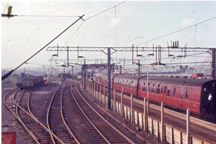
Looking north from Runcorn Signalbox along the Folly Lane Branch in the first half of the 1960s. The branch can be seen curving away to the left. To the right can be seen Runcorn station at which an electric hauled service is arriving.

The Folly Lane branch and Weston Point Light Railway became a very busy railway location. In the early 1960s the Folly Lane Branch was electrified. The decline started in the late 1980s when pipelines and road competition began to have an effect. On the 13 th of March 1994 the branch was de-electrified. By the mid 1990s the only rail traffic that was using the branch was a couple of times per week trip that ran between Warrington Arpley and the Salt Union Works. The service finished in 2000. In 2001 a new automated loading facility was opened at the site of the Picow Farm Road sidings by Ineos Chlor and at present three trains per week visit it. Paul Wright