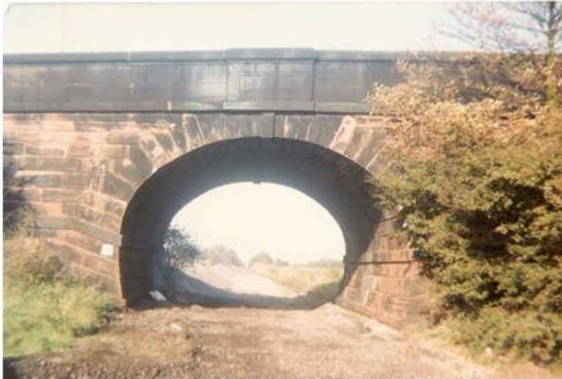
The bridge at Bold as seen looking north in 1983.

The section of the line walked on the 18 th of August 2011 included the last sections to remain in use and track was found to still be in situ from St Helens Central (formerly Shaw Street) to the site of the Hays Chemical Works (Formerly the Leathers Chemical Works). After its closure as a through route the line remained open at the St Helens end between St Helens Junction and St Helens Shaw Street and between Sutton Oak Junction and Sutton Manor Colliery. The first section to close was the line to Sutton Manor Colliery which was taken out of use on the 10 th of October 1987 up to the junction at Sutton Oak. The line had been lifted by May 1989. On the 27 th of May 1989 Sutton Oak signal box was taken out of use. The structure was burned down by vandals. The line between St Helens Junction and St Helens Shaw Street probably closed as a through route on the 11 th July 1990 which was the date when Ravenhead Junction signalbox was taken out of use. Between St Helens Junction and the Hays chemical works the line was lifted, and from Hays to St Helens it was remodelled being singled to the site of Ravenhead junction signal box with a run around loop at the site of Peasley Cross Station.