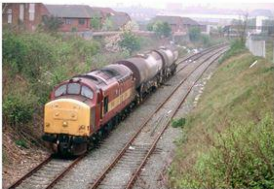
A train from the Hayes Chemical works at Peasley Cross Station site in 2002 the last year that the service ran.

On the 18 th of August 2011 six members of 8D visited the northern end of the line. Gaining access just to the north of the site of Peasley Cross Station the course of the line between Sutton Oak Station and Ravenhead Junction was surveyed.