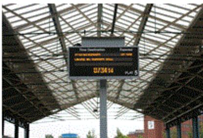
The departure indicator at Chester Station on the 6 th of August 2011

The Ghost train was clearly advertised on the station departure indicator but this did not stop another member of the station staff trying to advise the group to travel to Runcorn East.