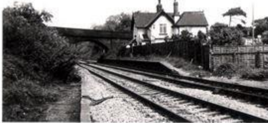
Halton Station in the early 1970s