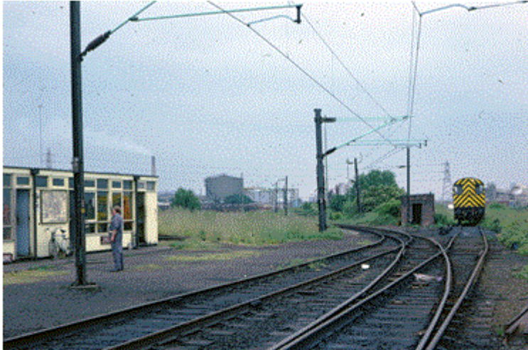
The Folly Lane Branch as seen looking west at Folly Lane in 1988. At this time BR based a class 08 diesel shunter on the branch and the line was still electrified. To the left of the picture can be seen the BR staff accommodation block.

The Folly Lane branch was opened in 1868 by the London & North Western Railway (LNWR). It connected the Runcorn Docks to the LNWR Ditton Junction and Weaver Junction line which provided a short cut for trains travelling between London and Liverpool by bridging the River Mersey at Runcorn. Prior to the line opening trains had to travel via Warrington.