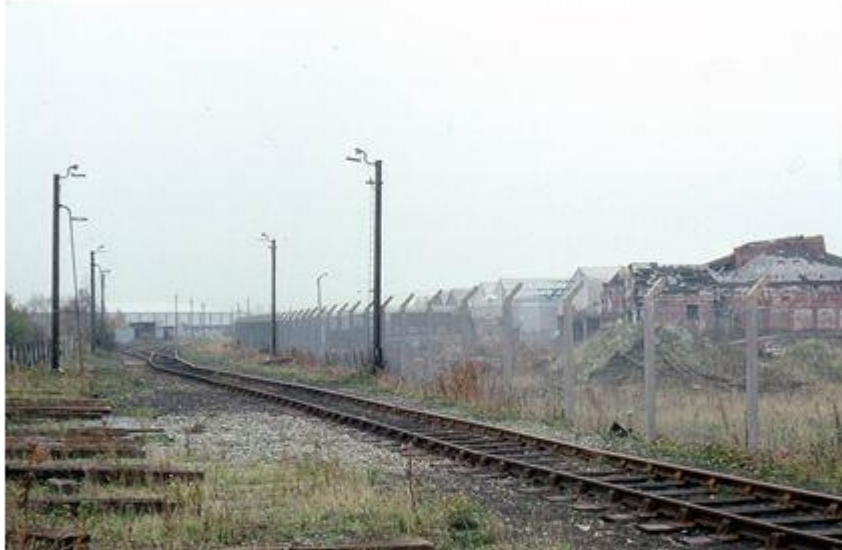
In this view from November 1990 the remains of the Ravenhead Branch just beyond Ravenhead Junction are shown.

Fading light prevented further explorations at Ravenhead Junction but a further site visit will be planned in 2012 so that this complex and fascinating railway location can be explored in more detail. Paul Wright