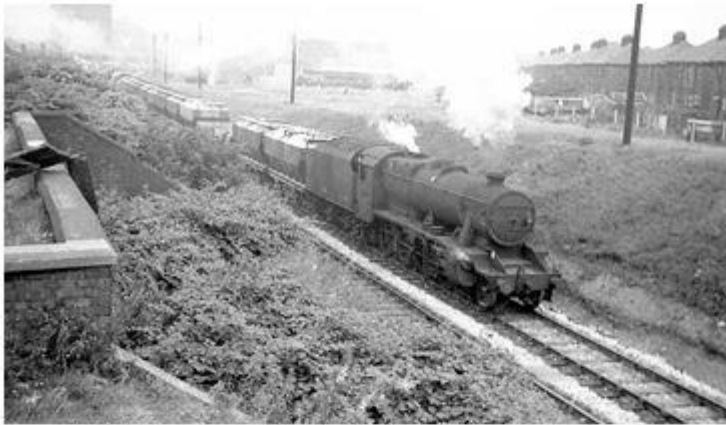
An ex LMS 8F Locomotive heads south through the site of Peasley Cross Station in 1965.

There was clear evidence that the bridge had been cleaned at some point in the recent past. During the walk the site of Union Bank Farm Halt which had opened on the 1 st of October 1911 and which closed on the 16 th of June 1951 was visited. The only evidence that there had ever been a halt at the location was a gate post at the top of the embankment.