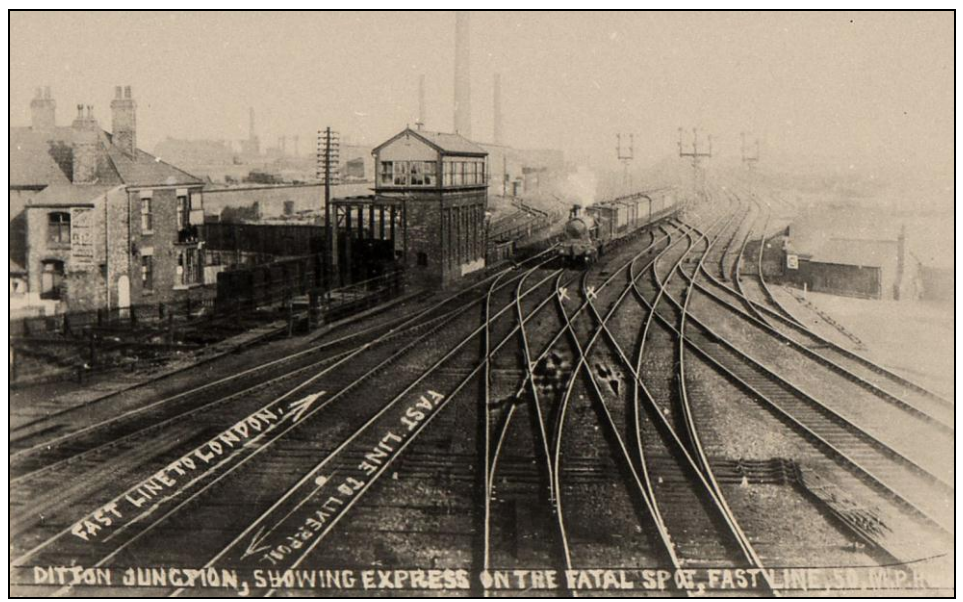
Ditton Junction looking east in 1912. The postcard view shows the point, marked by x's where the 15.30pm Chester to Liverpool Lime Street train left the rails at 6.05pm on 17<sup>th</sup> September 1912 with tragic consequences.