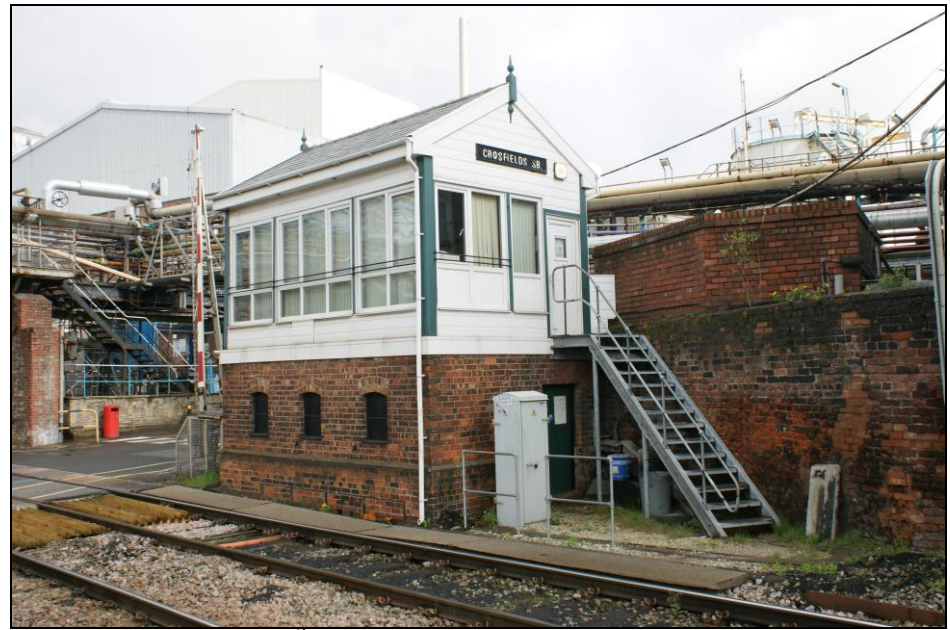
Crossfields signal box on 21st April 2012.

Crossfields and Littons Mill signal boxes have now closed. The boxes were due to close at 06.45 on Monday 7<sup>th</sup> of July 2012 but the closure was actually delayed by a week. The crossing at Crossfields is now controlled by Monks Siding box. A number of semaphore signals have been taken out and replaced with colour light signalling.