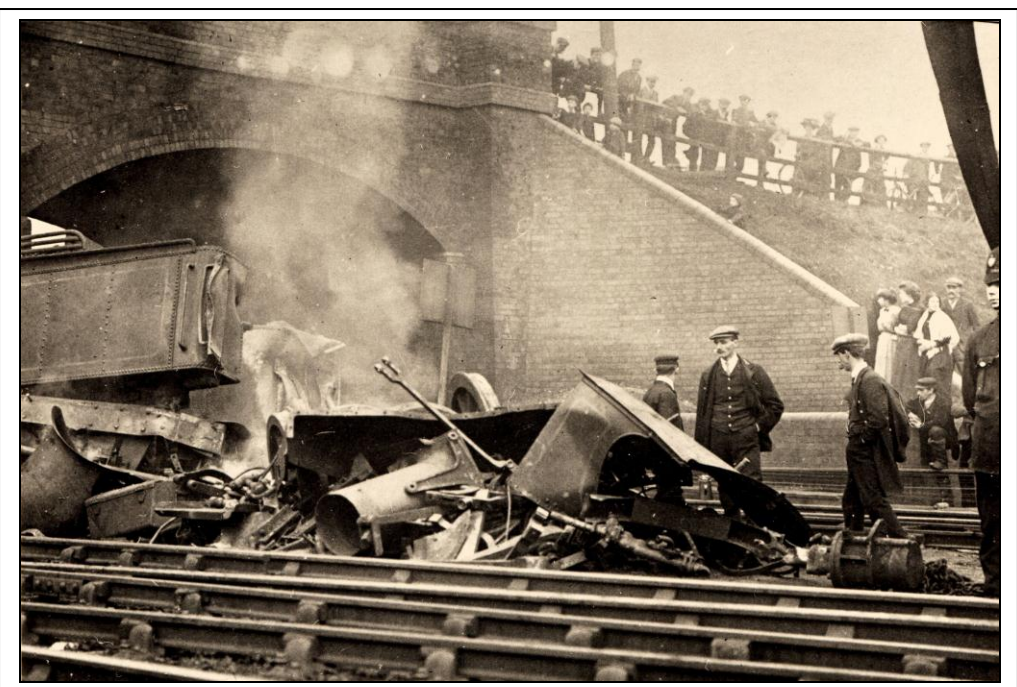
Wreckage from the locomotive 'Cook' at Ditton Junction the day after the crash.

passed cleaner. Lunn had only fired over the route to Liverpool on one previous occasion.