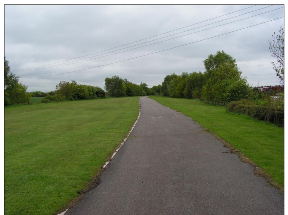
Looking towards the west along the route of the Clock Face Colliery branch on 19<sup>th</sup> of May 2012.

Face Colliery engine then attached itself to the rear portion of the train and hauled it to the pit head. A Sutton Manor locomotive then backed onto the remaining portion and hauled it to Sutton Manor. In the reverse direction the Clock Face engine haled the train to a point just outside the LNWR boundary, detached and went into a siding. The LNWR engine then backed onto the train drew it forward onto the main line and then propelled over a crossover to pick up the Sutton Manor portion.