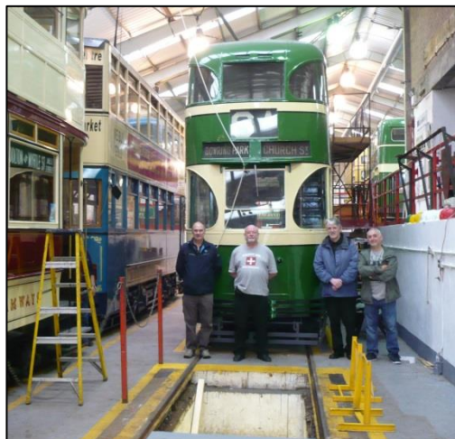
8D Association members pose by car number 245 during the 10 August 2014 visit to the Wirral Tramway and Wirral Transport Museum.