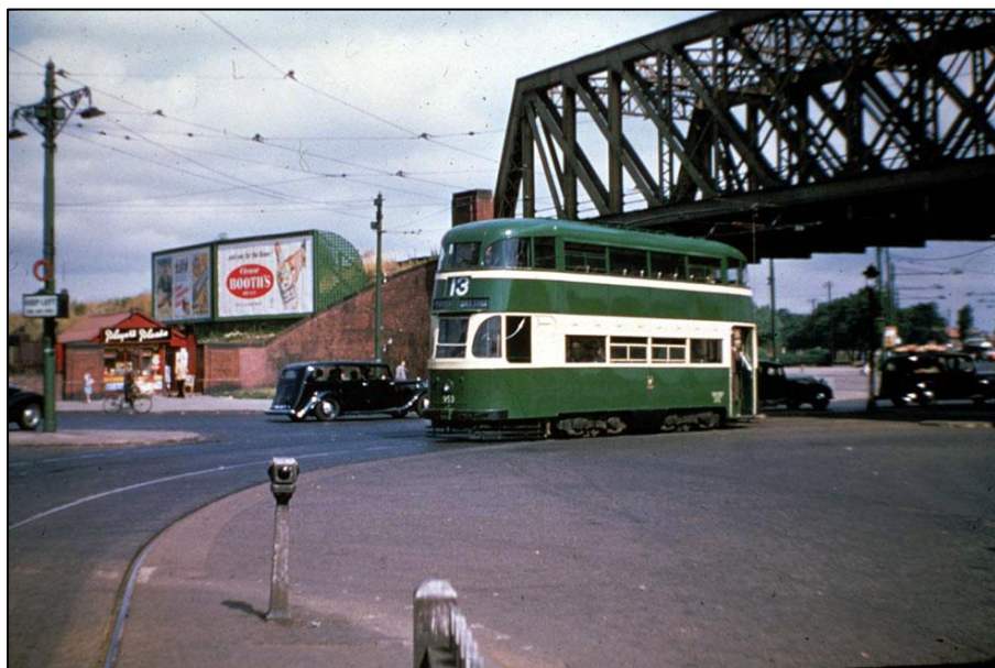
A Liverpool bogie steamliner is seen passing under the CLC Halewood – Aintree line at Clubmoor in the late 1940s. At this location passengers could change between tram and train. There were two types of steamliner the bogie version seen in this view and a four wheel version known as the 'Baby Grand'.

The Liverpool system continued to expand right up until the last new section was opened on 12 April 1944. By that time Liverpool had 97.37 miles of track.