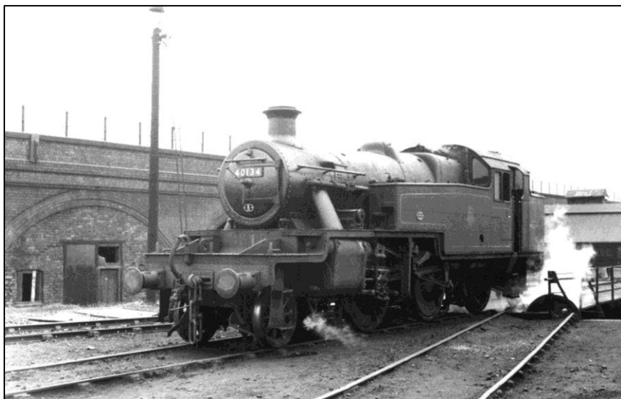
Ex-LMS 3P locomotive number 40134 is seen coming off the turntable at Widnes shed in 1955. The locomotive entered service with the LMS on 4 October 1935. She came to Widnes from Llandudno Junction on 6 October 1951 for the purpose of working local passenger services. The engine was withdrawn from Widnes on 6 October 1961.

We used to carry the bucket by threading the shovel through the handle and the lamps by doing the same with the Coal Pick. The resulting load was both heavy and awkward and resulted in a bow - legged walk along the shed to the locomotive. Since the footplate was above head height, getting the equipment (minus the running lamps) on board was also a challenge which sometimes resulted in being showered with tools as they spilled from the bucket.