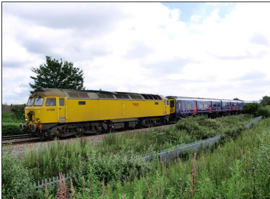
The class 319 EMU is seen passing Carterhouse Junction on 20 June 2014 hauled by class 57 locomotive number 57 306.

The original batch of 60 319/0 units were built at BREL York for the Thameslink project and introduced in 1987. The unit in question here was the first of the follow on order and designated 319/1 and introduced in 1990 numbered 319 161. Only slight differences existed between the two sub classes with the newer units having first class accommodation situated in one of the driving trailers and a Royal Mail area in the opposite driving trailer. The Royal Mail area included tip up bench seating and a lockable door for security whilst transporting mail. Between 1997 and 1999 the units were refurbished by Alstom at Eastleigh with the Royal Mail area and the first class accommodation being removed. Upon release from the works they were reclassified as 319/3 with 319 361 being the first of the new sub class.