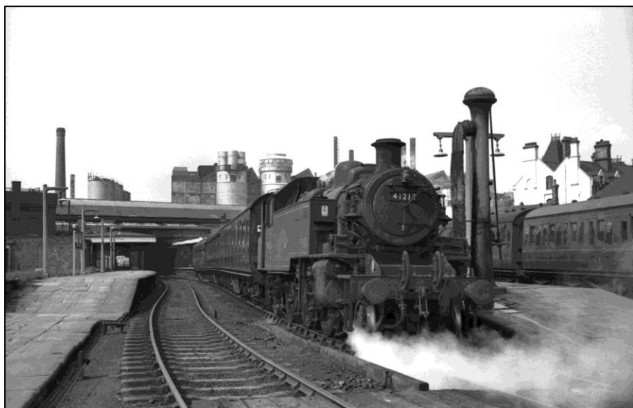
A Ditton Junction to Manchester Oxford Road service is seen at Warrington Bank Quay 'Low Level' in May 1961. At the head of the train is Ivatt 2MT locomotive number 41213 of Warrington Dallam shed. The engine entered service with British Railways on 4 September 1948 and was withdrawn from Barnstable Junction on 6 April 1963. Number 41213 left Warrington Dallam on 14 June 1958.

The next job involved making sure the Sander Boxes contained enough sand. There were usually 2 of these on each side of the loco and situated on the 'Main Framing' (the platform which ran above the driving wheels). The designer of the special sand buckets must have been a giant as they could hold a huge amount of sand and were, therefore, incredibly heavy. Despite this it was common practice to carry a bucket in each hand as it balanced the load on the trip from the sand drying facility near the office to the locomotive. This entailed yet another bow-legged stagger, but the real fun came when lifting the buckets onto the Main Framing. Yet another shower, but this time - a sand shower! It was normal to have to make 2 trips to complete the sanding operation so the process was universally detested by firemen.