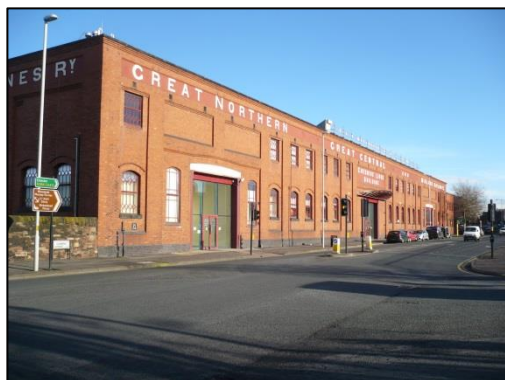
The CLC Shore Road goods station seen on 10 February 2014.

In the 1990s Shore Road was refurbished and became the Cheshire Lines Building which is the current home of Wirral Borough Council. Members were able to examine the goods station and see many original CLC features.