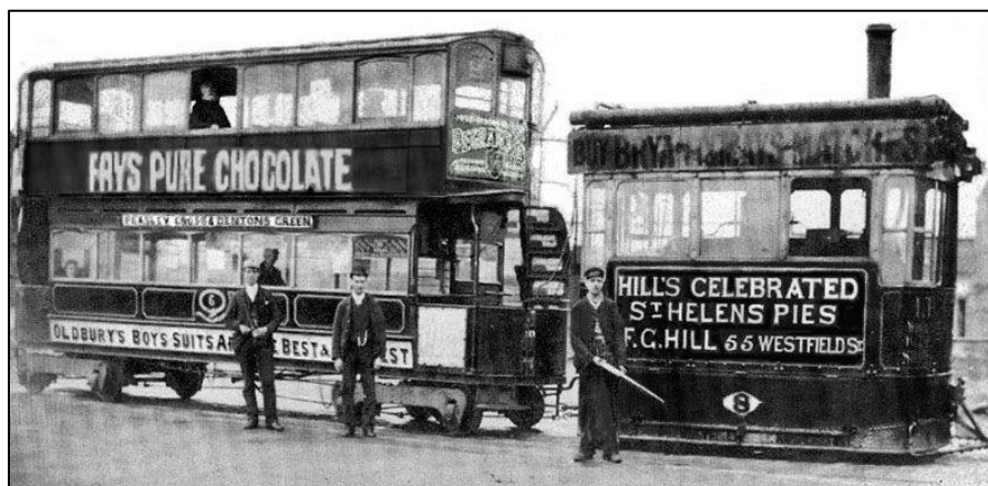
A St Helens steam hauled tram seen in 1895. Motive power is in the form of tramway engine number 8.

Electric trams began operation on 20 July 1899 on the Dentons Green route and on part of the line to Prescott. The system was fully electrified by 8 January 1901. On 4 April 1902 a connection was made at Haydock with the South Lancashire Tramways and on 25 June 1902 a connection was made with the Liverpool & Prescott Light Railway which in turn connected with the Liverpool system. Theoretically trams could run from Liverpool to Bolton but they never did.