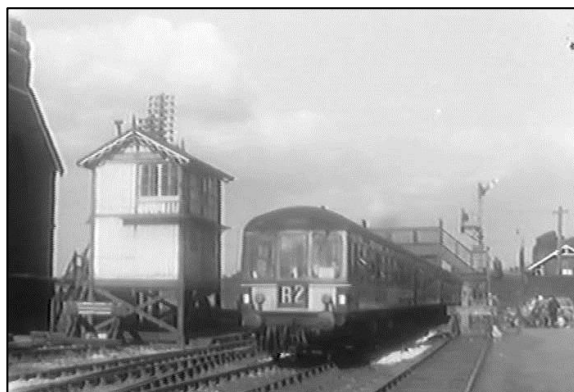
A class 108 Derby built DMU is seen departing from Tanhouse Lane station in 1964 on a service for Liverpool Central. Tanhouse Lane closed fifty years ago next month and its site was visited by 8D association members on 5 June 2014.