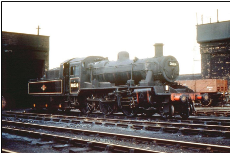
British Railways standard class 2MT locomotive number 78034 on shed at Widnes on 20 August 1961. Number 78034 entered service in October 1954 being allocated to Rhyl. She came to Widnes on 19 May 1955 and remained there until 9 September 1961. After spending time at Nuneaton, Bangor, Watford and Willesden 78034 was withdrawn from Crewe South in January 1966.

Each 'On Shed' issue whisks me back to the 1950's and '60s and my time on the footplate based at Widnes Locomotive Shed. Despite the terribly unsociable hours we worked, I thoroughly enjoyed the job and felt lucky to have been able to live every schoolboy's dream. However it has occurred to me that by modern standards the Fireman's job was often quite hard and so I thought I'd share some of the details with readers.