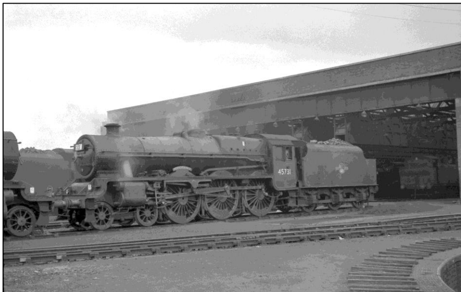
Stanier Jubilee class locomotive number 45731 'Perseverance' stands outside Warrington Dallam shed on 22 October 1961. The locomotive entered service with the LMS as number 5731 on 21 October 1936. When British Railways was formed the locomotive was at Carlisle Kingmoor depot. She had a brief spell at Carlisle Upperby from 2 September 1961 until 7 July 1962 when she returned to Kingmoor. Later that month on 21 July 1962 she went to Blackpool Central where she remained until withdrawal on 20 October 1962.

The final step was topping up the water in the tender. There was a water column near the entrance to the shed which consisted of a huge leather tube (about 400mm in diameter) which was placed in an aperture at the top rear of the tender. It was really important to ensure that there were no kinks in the tube (we called it 'the bag') or it would flick out of the aperture and act like a giant hose under pressure soaking everything and everybody in close proximity.