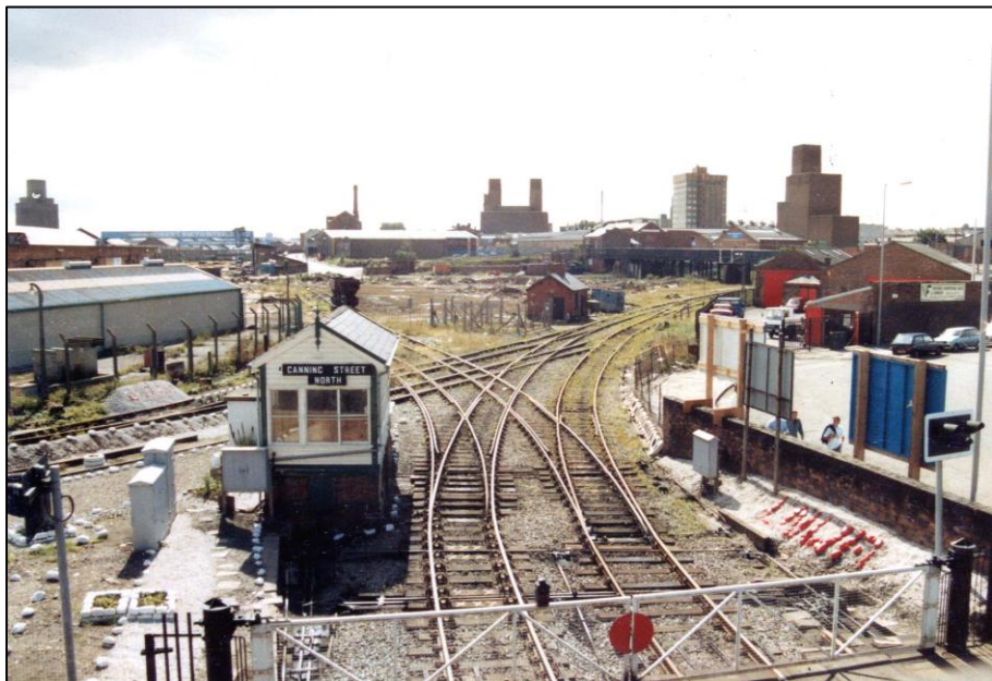
Looking towards the Shore Road CLC goods station from Canning Street North junction in the summer of 1988. The lines branching off to the left led to Shore Road and those to the right ran to Blackpool Street where they joined the main line to Chester.

Junction (near Helsby) and Brook Street Junction (Birkenhead). From Brook Street Junction the CLC had a 26 chain branch that ran to Birkenhead Shore Road Goods station. The station was one of the busiest on the CLC network and remained open until 5 June 1961. Even after closure some the sidings within the yard area continued to be used right up until the late 1980s.