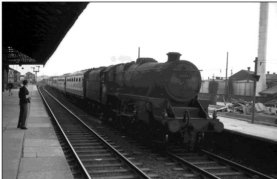
Ex-LMS 5MT 'Black 5' number 45429 on a passenger train at Warrington Bank Quay on 26 August 1961.

On Sunday the 10th of August, Widnes Vikings failed in their bid to reach the Rugby League Challenge Cup Final at Wembley for the first time since 1993. If they had done so, what if any would the Cup Final specials have been like. The west coast main line was closed at the southern end on the day of the final so Pendolino's would not have been of any use. Perhaps stock would have been chartered from West Coast Rail. Perhaps there would have been no specials at all.