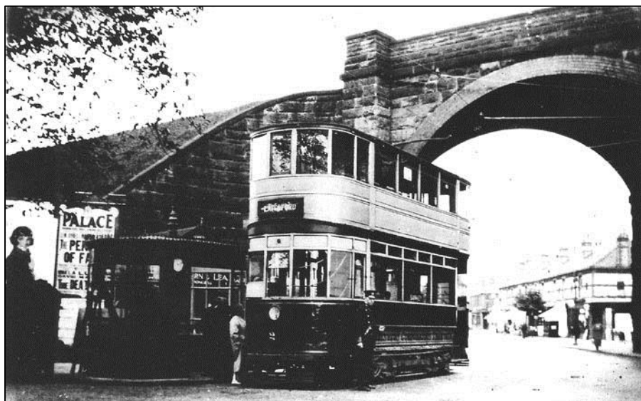
Warrington tram number 2 at the Latchford terminus circa 1930. Towering above the tram is the Warrington Arpley – Broadheath line. Tram number 2 is currently being restored at the Wirral Transport Museum.

Trams came to Warrington on 21 April 1902. It was an electric system and municipally owned from the start. The first line to open was the 1 ½ route from Rylands Street to Latchford. The line was double track throughout. A few days later on 23 April 1902 a line opened from Rylands Street to Sankey Bridges. It was also 1 ½ miles in length but much of it was single track. Trams operated along both lines as a through route.