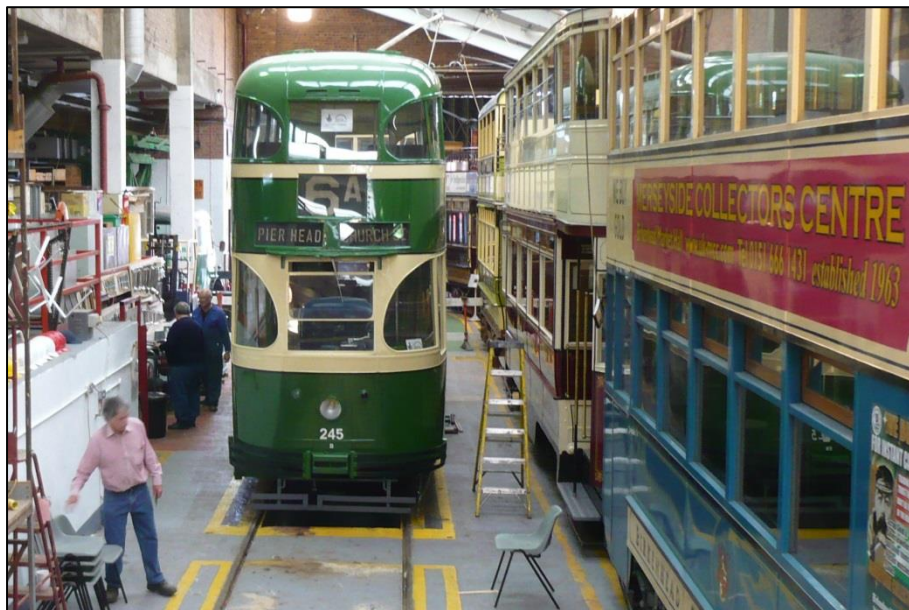
Liverpool Corporation Tramways 'Baby Grand' car number 245 seen at the Wirral Transport Museum on 10 August 2014 during a visit by the 8D Association. To the right is a line of cars from the Birkenhead, Wallasey, Liverpool and Hong Kong systems.

On 10 August 2014 the 8D Association visited the Wirral Tramway and Wirral Transport museum in Birkenhead. Unfortunately no trams were running at the time of the visit due to an incident that had taken place which had resulted in the loss of the overhead power supply within the museum building where the trams are kept. Despite the fact that no trams were running there was much to see of interest during the visit. Birkenhead has a rich railway and tramway heritage and members were able to view the remains of the former Birkenhead Woodside station, the Mersey Railway Hamilton Square station, the Cheshire Lines Railway goods station at Shore Road, the site of the Woodside terminus of Europe's first street tramway, the terminus of the Hoylake Railway street tramway and the present day Wirral Tramway.