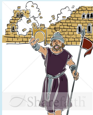
Joshua at the Walls of Jericho

Joshua was not only a man of faith but a great leader of men and a great General, but Joshua's faith was in God first and foremost. He seeked the Lord for direction for the people that he was leading on many occasions.