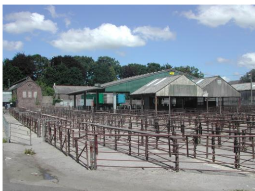
The livestock market