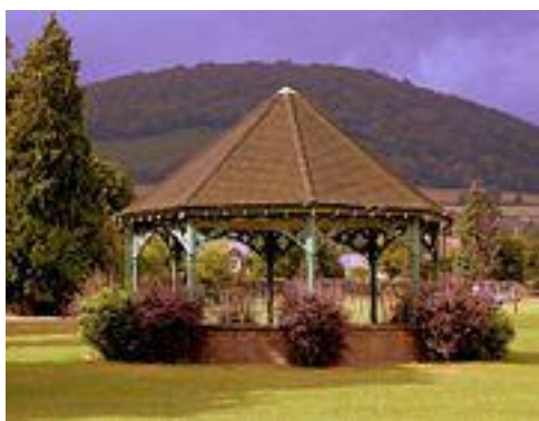
Bandstand & the Deri beyond

Walk back to the North Gate or follow Extension B by turning left off Frogmore Street into Cibi Walk.