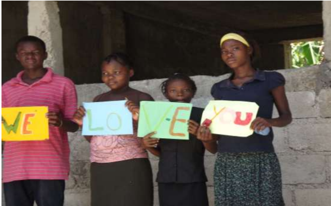
Lévêque school children speak – WE LOVE YOU