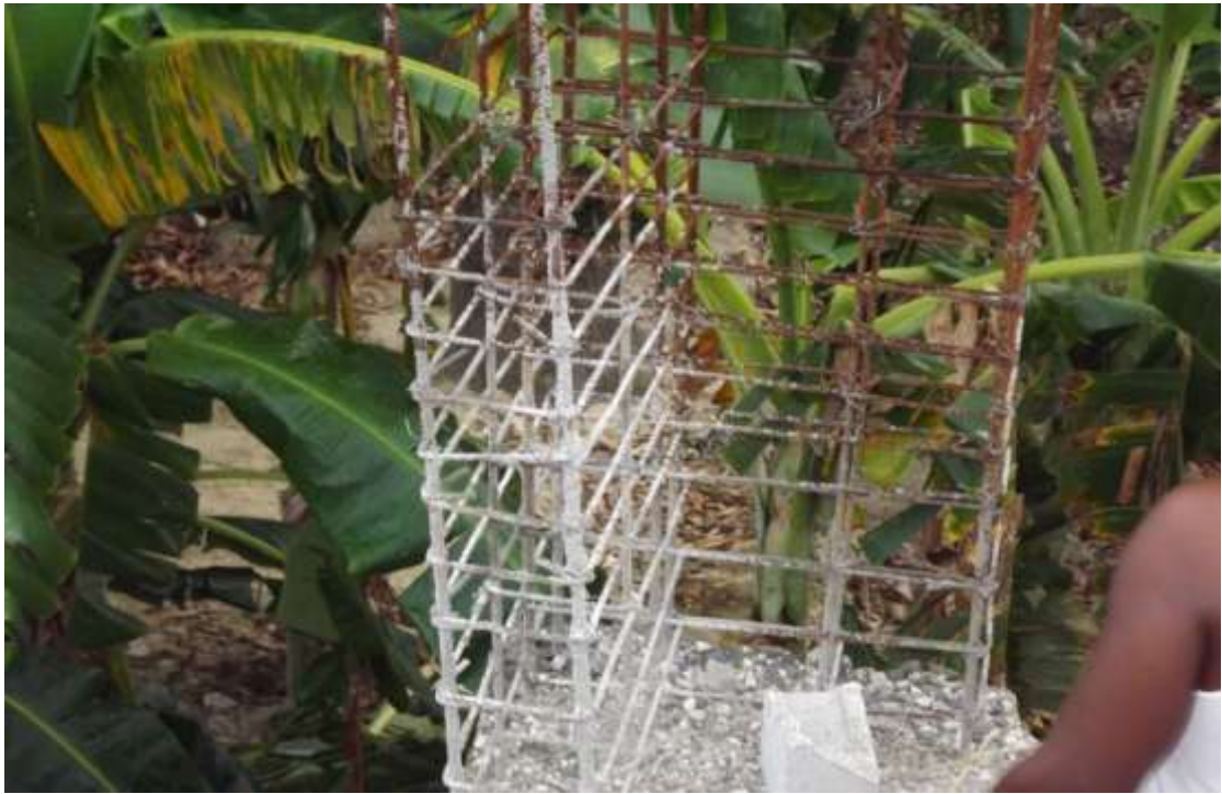
Supporting pillars/beams of construction