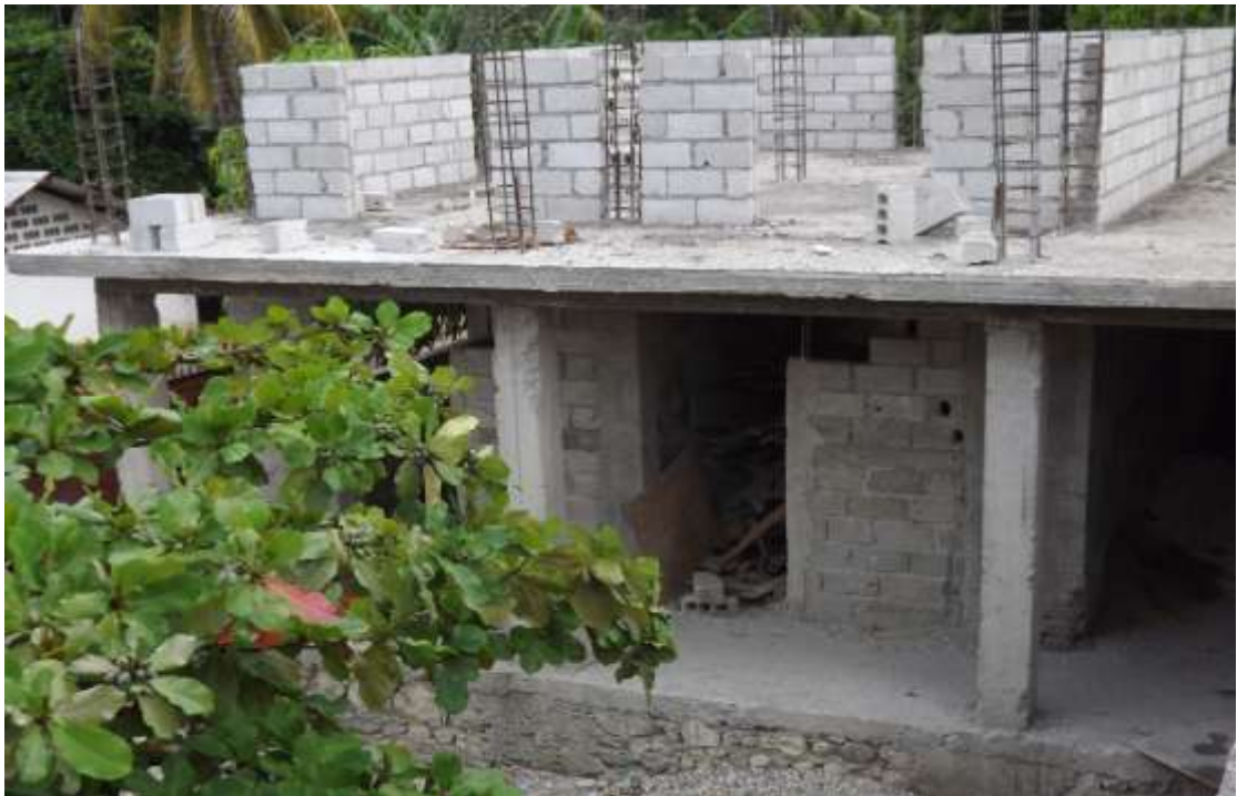
Head-teacher's and Bursar's rooms