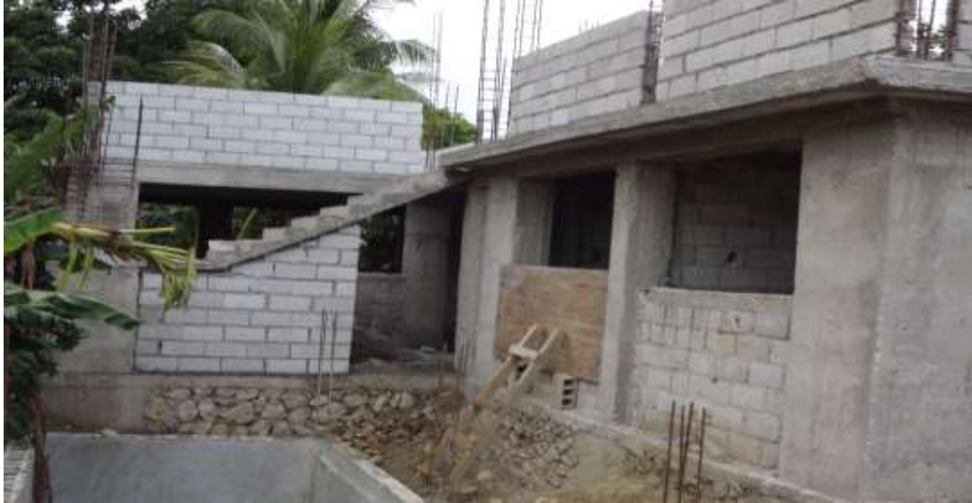
Northern side of the school

Marcus returned to Haiti in July to visit the site and returned with these pictures.