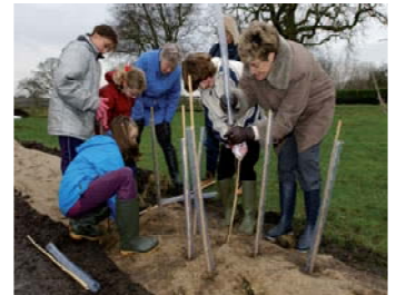
Training and Volunteers - opportunities for volunteering and training in archaeological and habitat survey techniques and practical conservation