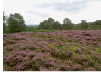
Habitats of the Ridge - conserving woodlands, heathlands, meres and mosses to create a habitat network.