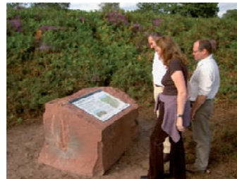
Access and Interpretation - improving access and interpretation and links to the Sandstone Trail