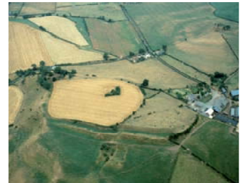
Hillforts of the Ridge - investigating and managing the hillforts through archaeological survey and management plans