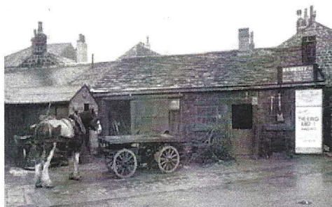
A poster outside the old forge in Weetwood Lane advertises THE KING AND I in 1956