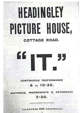
An early advertisement for the cinema in the Headingley Directory, 1913