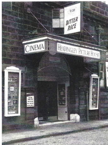
The cinema entrance in 1951