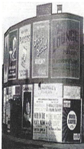
A 1928 hoarding in North Lane advertises 2 films at Headingley Picture House - WE'RE IN THE NAVY NOW starring Wallace Beery and THE NIGHT OF LOVE starring Ronald Coleman