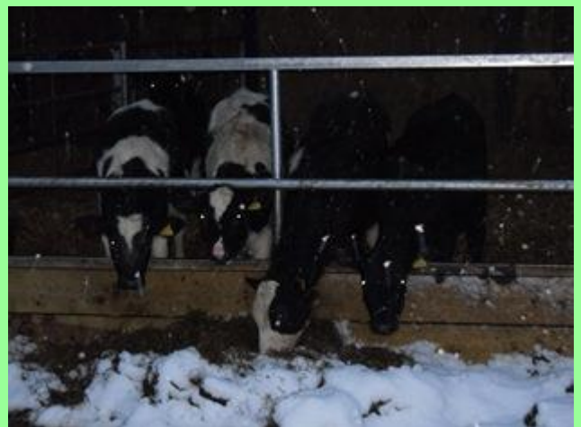
Here are the calves glad to be in their warm and dry cubicles.