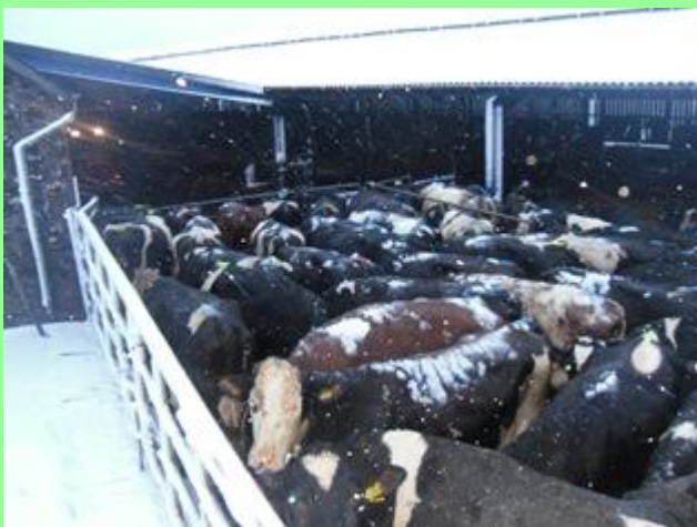
The cows in the collecting yard waiting their turn to go into the parlour to be milked.