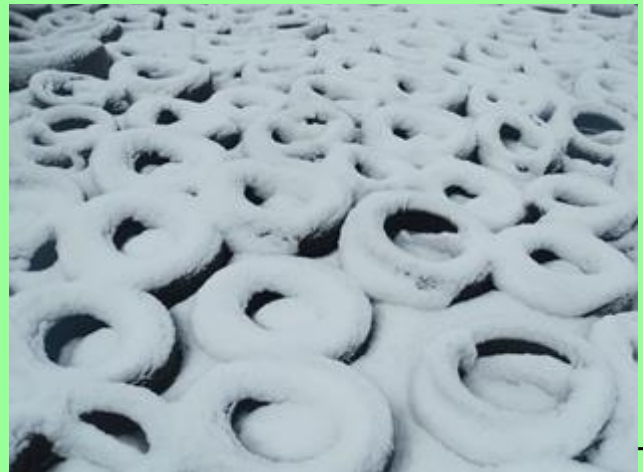
Tyres on the silage clamp - just thought this looked a pretty pattern!

To prevent the milking parlour from freezing, we've made roller blinds for each end of the parlour, and installed a space heater which runs for quarter of an hour each hour during the night to maintain a reasonable temperature in the parlour.