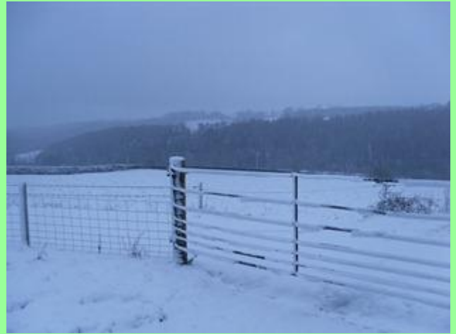
Snow covered fields.

Well, our children have got the snow they wished for!! It might not have been here for Christmas but they got a day off school on the 18th so they were happy sledging and making a snowman!!