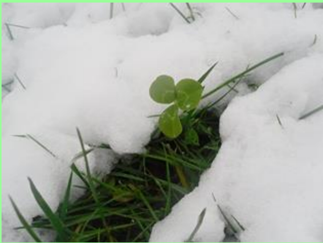
A brave clover poking through.

Up until now the grass growth during the winter has been above average with the mild winter temperatures. However this cold spell will now stop the grass growing and if it remains at sub zero temperatures the grass may even disappear or get burnt by the ice/frost (turn brown). This will affect the early spring turnout. Clover is very important on an organic farm and requires the soil temperature to be 10 degrees for it to continue growing.