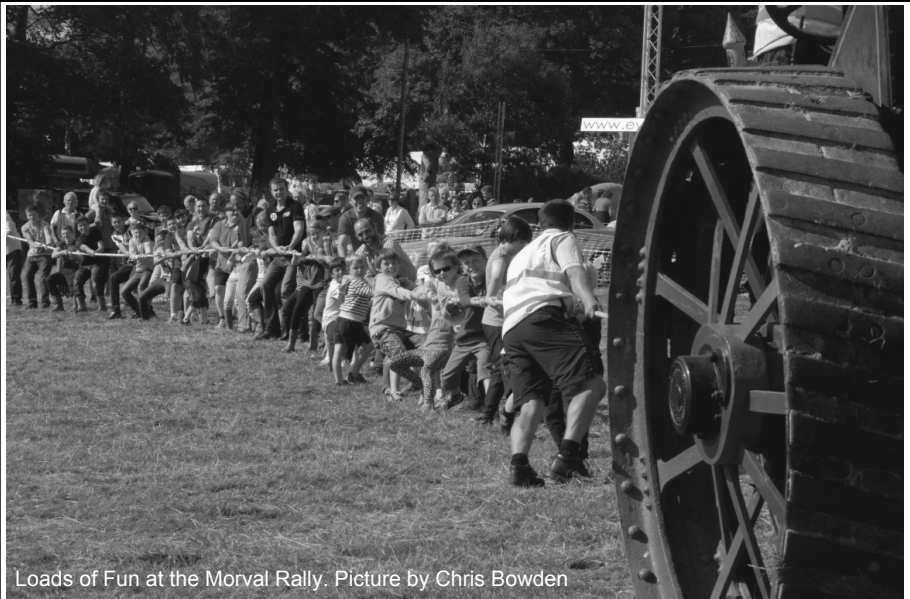
Lloads of Fun at the Morval Rally.