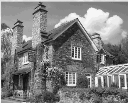
2 miles north of Looe at the junction of the A387 and B3254 to Duloe

At Polraen Country House, Sandplace, Looe, PL13 1PJ