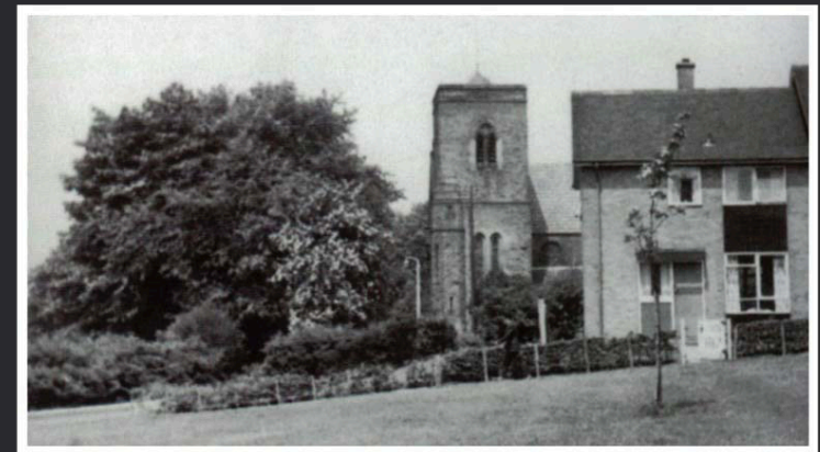
St Charles Borromeo Catholic Church