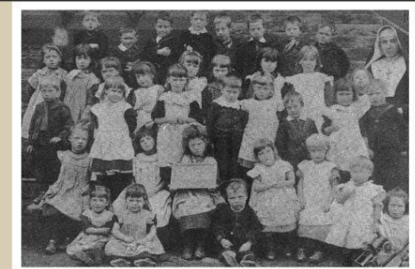
School class c1900