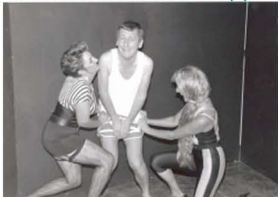
No sex please! We're British! (1990)

What has been your favourite LIDOS role / show to be involved with, and why?