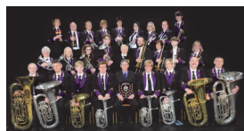
Swinton Brass Band Darlington

We are in the process of contacting local business for support and promises and if there is anyone in the village who would like to support the band and can offer us a promise or donation we would be very grateful.