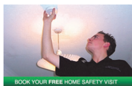
Install and Check Your Smoke Alarm