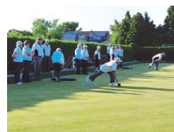
Flat Green Bowls

For More Information contact Matt Fenwick 01653 694640