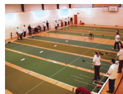
Indoor Short Mat Bowls

For more Details Contact. Richard good 01653 697921 Freda Fenwick 01653 694640