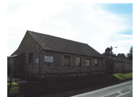
Swinton Reading Room And Community Hall