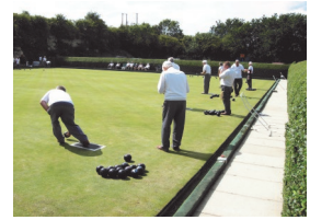
Flat Green Lawn Bowls