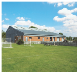
BSA Sports Centre