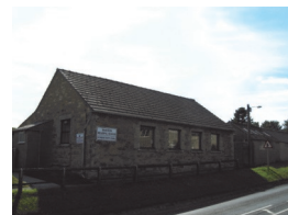
Swinton Reading Room And Community Hall