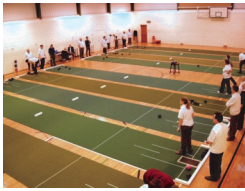
Short Mat Bowls