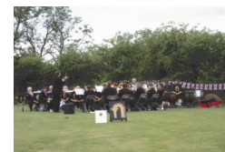
Swinton Brass Band

Some of you may have seen in the Gazette that we have recently received a grant to buy new instruments for our training band. We have had quite a few new starters lately and all the new cornets are now in use, (though we do have others) but we have a new baritone and Euphonium available so anyone interested in learning to play an instrument please contact Tracey on the above number. If you have played a brass instrument before and would like to take it up again you will also be very welcome. The loan of the instrument and lessons are free!! We are also actively seeking an experienced kit drummer.