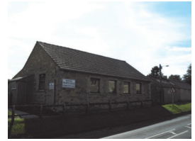
Swinton Reading Room And Community Hall