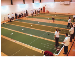
Short Mat Bowls