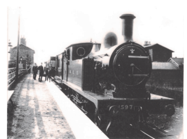
NER Steam Train Amotherby Station 1895