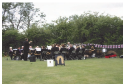
Swinton Brass Band