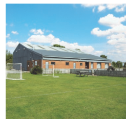
BSA Sports Centre