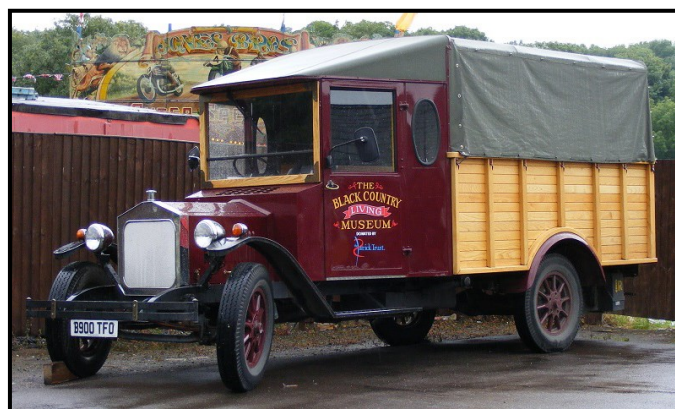
Replica Petrol Lorry