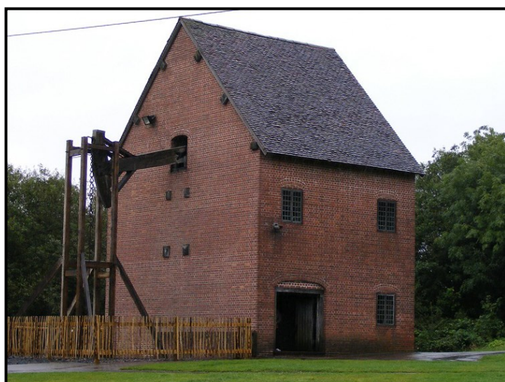
Replica Newcomen Beam Engine

A few photographs follow taken in the Black Country Museum.