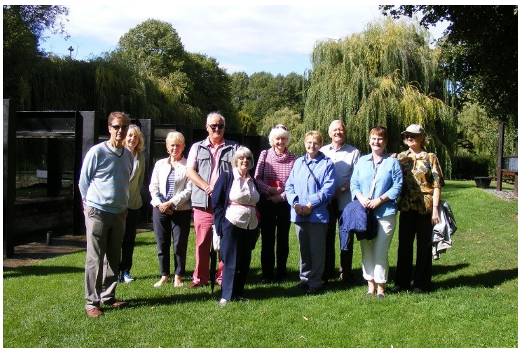
Group Photograph near Colin Witter Lock