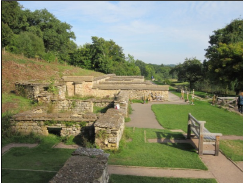
View of north range of buildings.

There are mosaic floors under the grass on the right and under the pathway that runs along in front of the buildings. It is hoped to display them in the future when funds can be secured to build protective buildings.