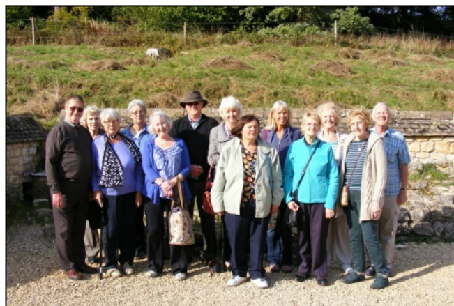
U3A group at Chedworth, pictured in front of the remains of a summer dining room.

Museum and Office building (Victorian period)