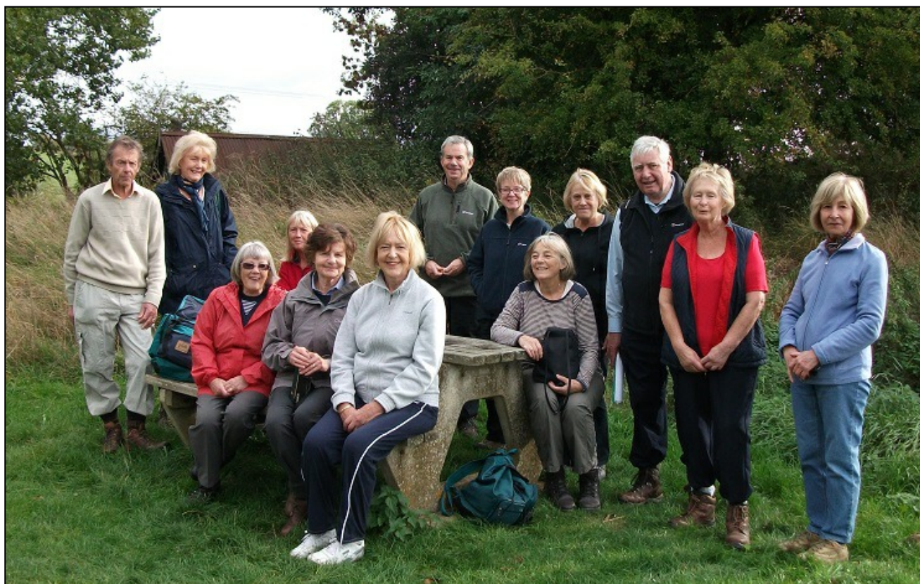
Group photograph when we stopped by the lock for a snack.

After the break we continued on towards Dorsington where we had to forsake footpaths in favour of walking along the road, fortunately not too busy. We continued back to Welford via road and footpaths. About 5.5 to 6 miles. Weather was dry but dull.