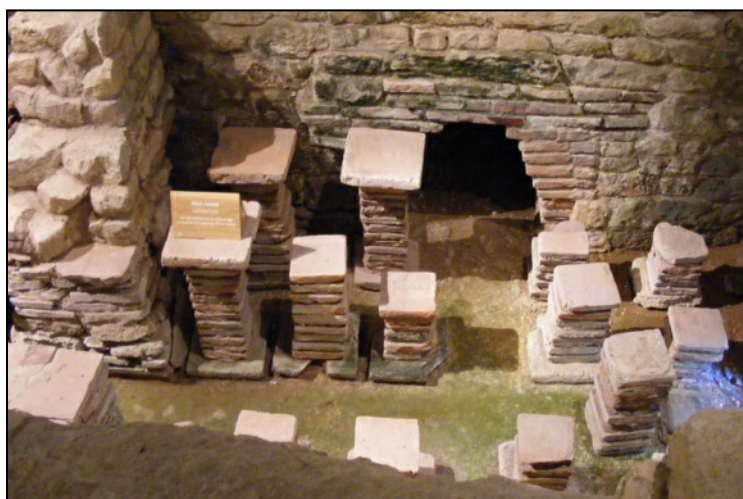
Middle left - mosaic floor and exposed hypocaust heating system under.