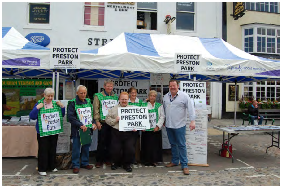
Supporters, Committee members and Vice-Chairman of Yarm Town Council at the stall

We made contact with many people and raised funds in excess of £500. Our thanks to the many contributors to our prize selection.