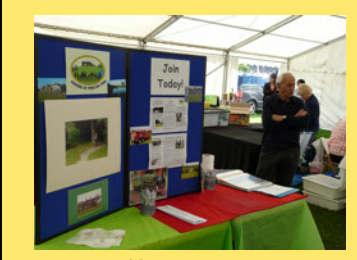
Stall at Summer Show

Wheelchair & walker provided for the use of visitors with mobility difficulties.