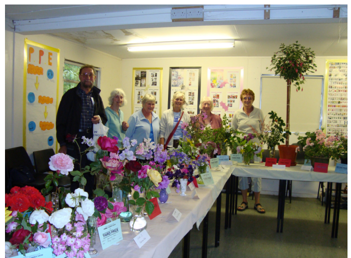
The smiling winners and their wonderful display