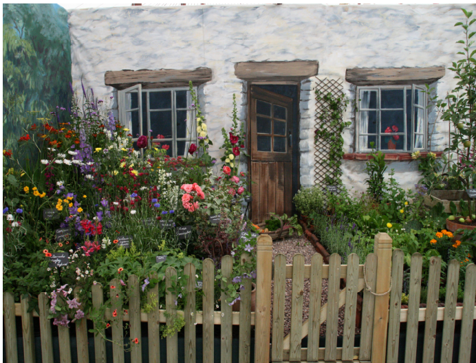
The Cottage Garden Society award-winning stand at the Tatton Flower Show

It was so satisfying to be on duty on a stand, where the first word people said when they saw it was 'Wow'! That was the main reaction to the display we had put together for this year's Tatton Flower Show and, much to our delight, the judges agreed and gave us a gold medal!