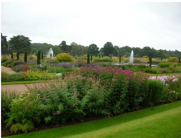
The Italian Garden at Trentham