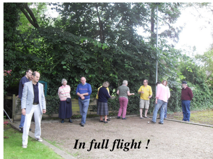
In full flight !

daunting task of organising the event and the weather was particularly kind to us throughout the day.