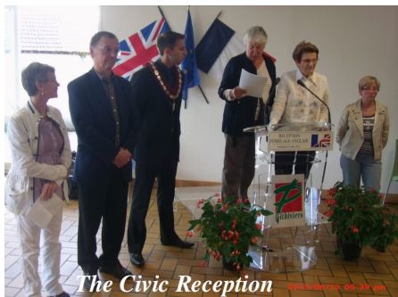
The Civic Reception

striding the decks on the ferry - fish and chip lunch to remind ourselves that we're British!! Ah!! the smell of the salt in the spray, the roll of the ship, - the lure of the onboard shops - what it is to be afloat! The landing at Calais - driving on the right at last - tea, coffee and biscuits served by the APA "trolley dollies" - what balance and dexterity shown by the catering staff!! Who can forget the quiz!! - or remember any of