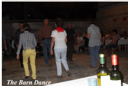
The Barn Dance

which beguiled us with a number of French songs including the Marseillaise. The Pithiviers Municipal delegation also joined us at the twinning meal and Barn Dance in the evening, where we were ably entertained by "Calling Time" and a great time was had by all