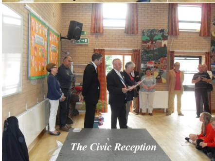
The Civic Reception