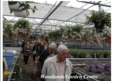
Woodlands Garden Centre

centre, where we enjoyed a very traditional British lunch of roast beef and apple crumble following a unique