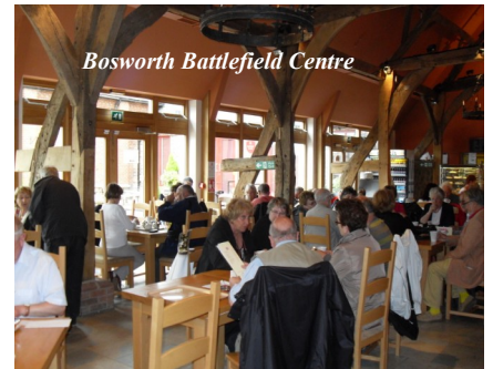
Bosworth Battlefield Centre

Finally, at the crack of dawn on Tuesday morning we waved our friends off at the Royal Hotel to face what turned out to be