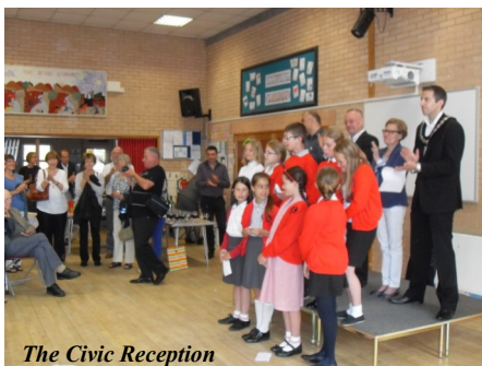
The Civic Reception

On Friday they and an Ashby group set off for the Peak District to begin with a tour around Poole's Cavern near Buxton,