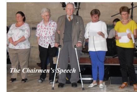
The Chairmen's Speech