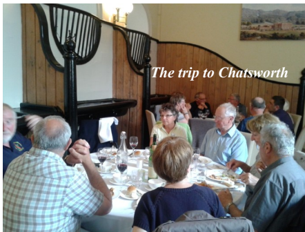
The trip to Chatsworth