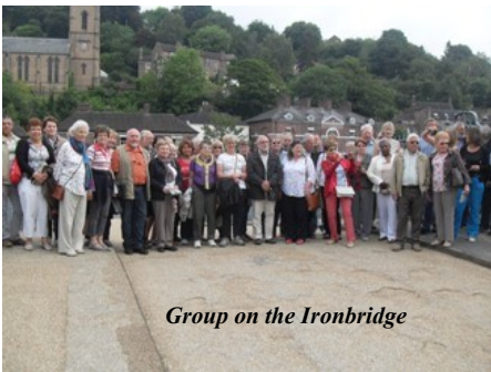
Group on the Ironbridge

This year our friends arrived in good time having spent Wednesday night