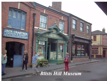
Blists Hill Museum

crossing from Caen to Portsmouth and paying a visit to Blenheim Palace on the way to Ashby. The Friday trip we had arranged was to Ironbridge and then on to Blists Hill Museum to show them something of our industrial history. Ancient though it now is, the Ironbridge remains an impressive monument of industrial archaeology and after inspecting it we offered complimentary tea or coffee at a nearby café before continuing to the Victorian Museum and lunch. We were then free to roam the fascinating streets of this re-constructed