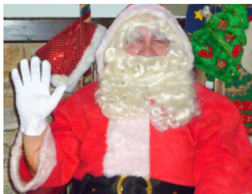
Santa Claus, aided by his faithful helper, had many small visitors to his Grotto in the vestry