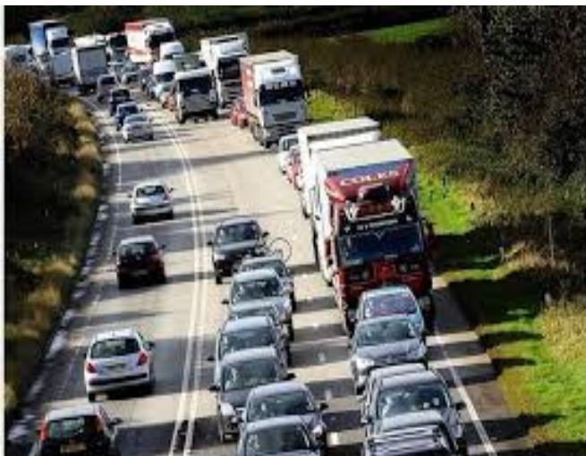
The ill-thought out Ilminster Bypass