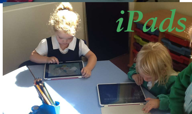
Children have been enjoying using the new iPads in class, these were purchased using money raised by the Friends. They are using a range of Apps to help with their spelling and maths. We hope you have been hearing all about them!