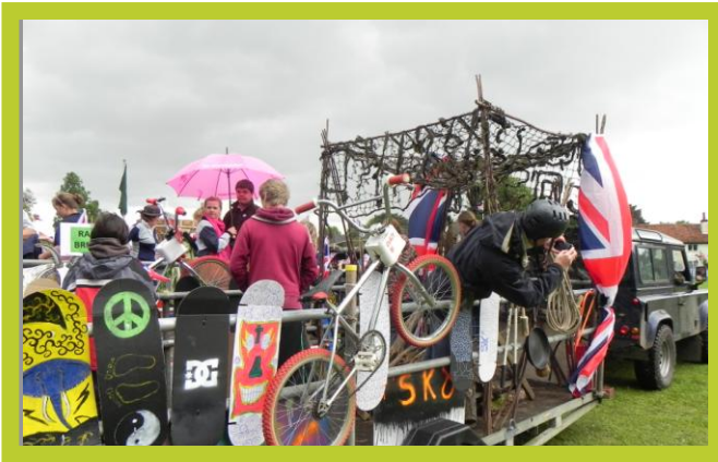
Youth Council's Jubilee float showing our skate and bushcraft projects

We have been running since July 2010 and 2012 has been a very busy year!