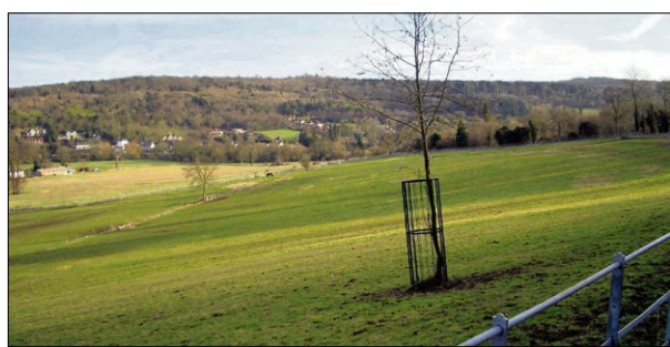
More than 2,000 trees are to be planted at an important buffer zone.