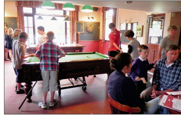
Brockham teens have fun as the youth council meets.

The council, which has already established a permanent