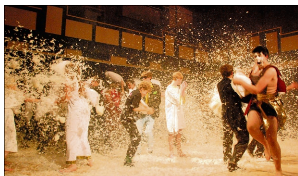
The pillow fight from Woody Allen's God was spectacular.

WOODY Allen was the toast of a Leatherhead school as pupils staged two of his comedies.