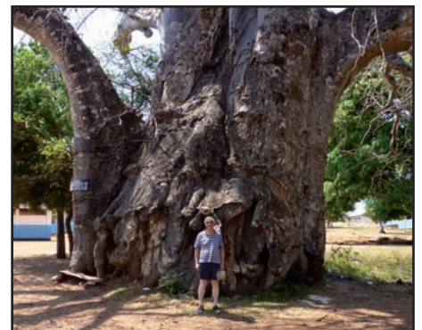
A Baobab tree, more than a thousand years old, which I photographed on holiday in a village by the ocean in south Zanzibar.

The euro-sceptic Conservative right-wing is incoherent and illogical. They want to "protect the integrity of the Single Market" while also wanting "to repatriate powers" without saying which ones. You cannot do both.