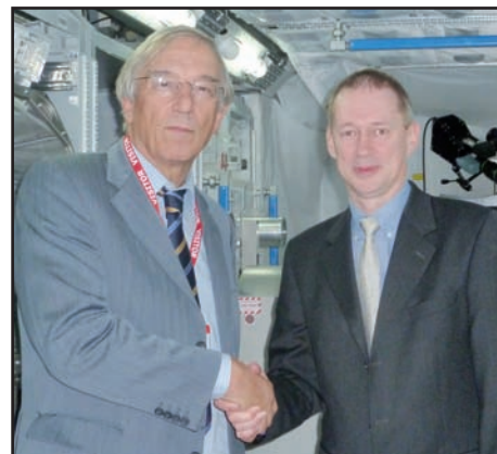
Meeting Frank de Winne at the European Space Agency research centre at Noordwijk, He was the first European to command the International Space Station.