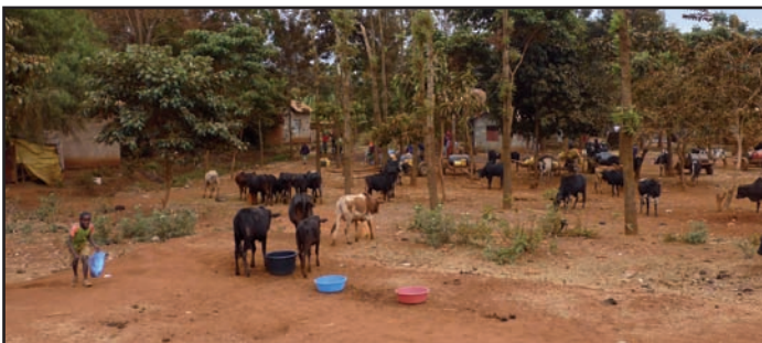
In central Tanzania, cows are parked, waiting for their owners to return with refilled water containers, before hauling them back to their villages.

How to make more of our aid successful ? The 27 national EU governments should start to liaise with each other (incredibly, they do not liaise at present) in order to reduce duplication and lack of coordination. In Africa we do not have enough people on the ground to see where the money goes because Europe finances so many different projects. Bill Gates (ex Microsoft) described to our committee how, when he donates aid for a medical project, he sends someone along to check whether the money is being well spent and, if it is not, he cancels the payment.