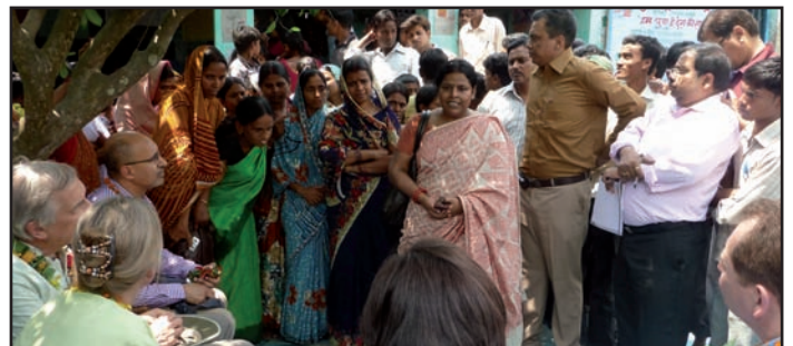
Visiting a village in Bihar, the poorest state in India, where the poorest women are helped not to marry off their daughters at thirteen years old