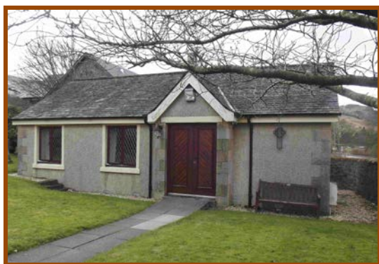
Fintry Kirk Session House (Built in 1992)

The Guild meets on the first Monday of the month in the Session House.