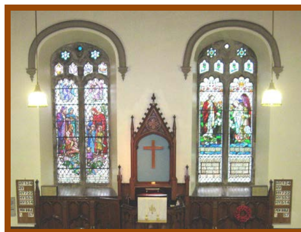
Fintry Kirk Memorial Window (on right)

Our linkage with Balfron is active and healthy and we enjoy sharing services during the month of July and supporting each other when special events are held. We also meet together for Holy Week. We always enjoy coming together and would like to do so more often.