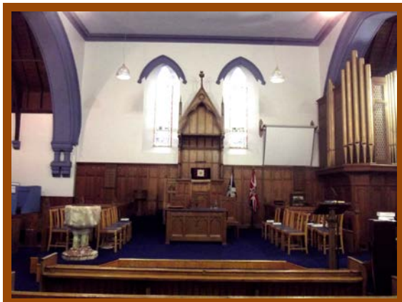
Interior of Balfron Church

The church is financially sound and all commitments are met from offerings and a Gift Day. Gift Aid is also used.