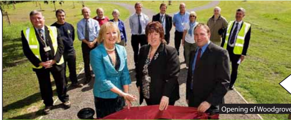
Opening of Woodgrove