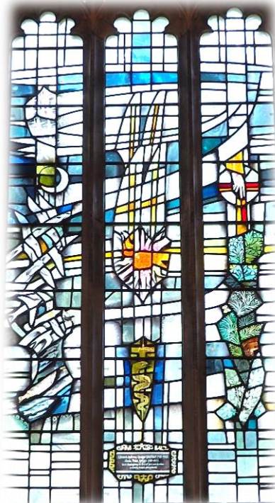
The Spriggs Memorial Window

Crib service, Christingle etc. as appropriate.