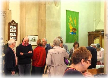
People join together for coffee and a chat after the Service