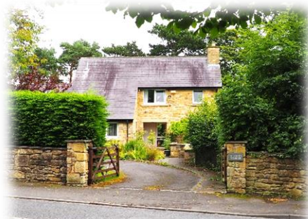
The Parsonage is a well appointed four bedroom property