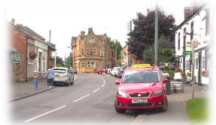
The Village of Wylam