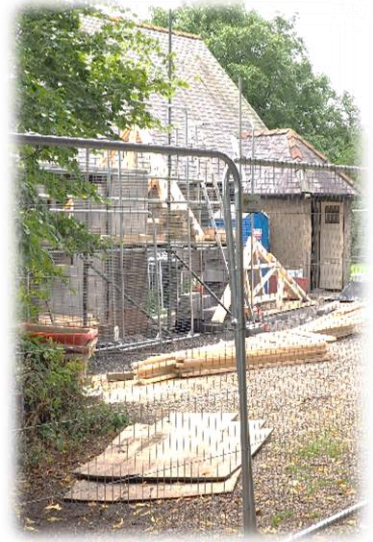
The Church Hall undergoing refurbishment

Apart from regular use for church purposes, coffee after morning service etc., all the uniformed groups meet there and it is available for hire generally. It is estimated that over 3000 people will use the hall each year.