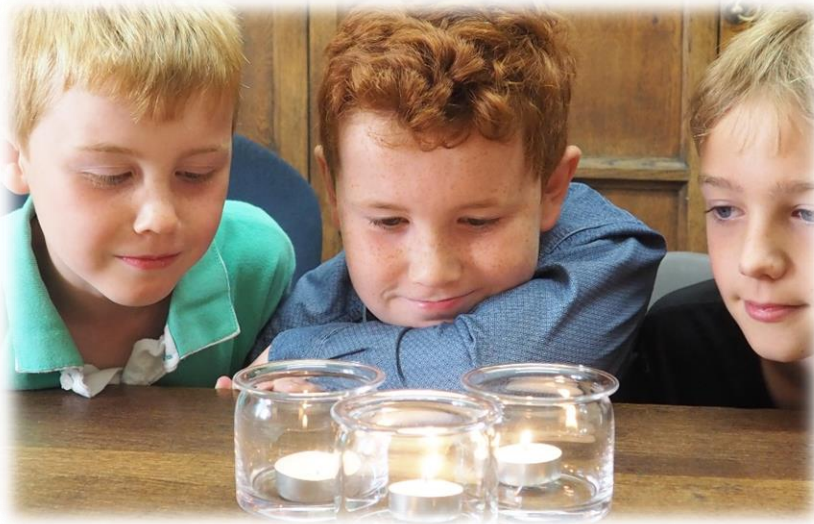
Thinking about prayer at Sunday School