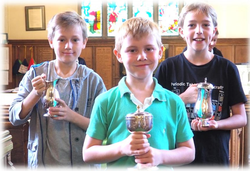
The Offertory Procession