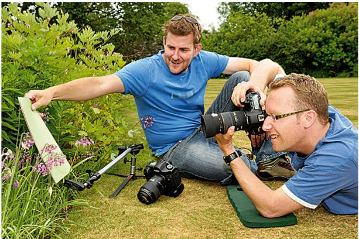
Flower photography tip: use coloured card to provide a studio-style macro background.

The background that you choose to photograph a flower against can either make or break the final image. A plant photographed with a soft, uncluttered background can stand out; a distracting, messy background can easily ruin what could have been a great shot if you'd thought a bit more. Use longer lenses and wider focal lengths to minimise any distractions.