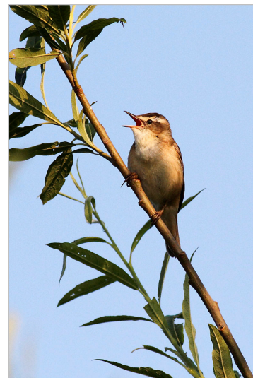
Fig. 7 Sedge Warblers visit the Wetland to breed each year. (R D E Stott)

Regular summer visitors arrived a little later than usual this year. A Barn Swallow was recorded on 13 Apr (5 Apr in 2012), Sand Martins on 18 Apr (3 May in 2012) and Common Swifts on 5 May (26 Apr in 2012) although House Martins were a little earlier on 18 Apr (26 Apr in 2012). Conversely the last Common Snipe was recorded on 5 May, a record late date for us. Warblers arrived in force during April, with Chiffchaff on 6 th , Blackcap , Willow and Reed Warblers on 13 th with Sedge Warbler and Common Whitethroat on 25 th . Among the occasional visitors, a Great Crested Grebe was seen on the river on 9 May. 84 species have been recorded on our regular bird surveys this year to date (85 were recorded during the whole of 2012).