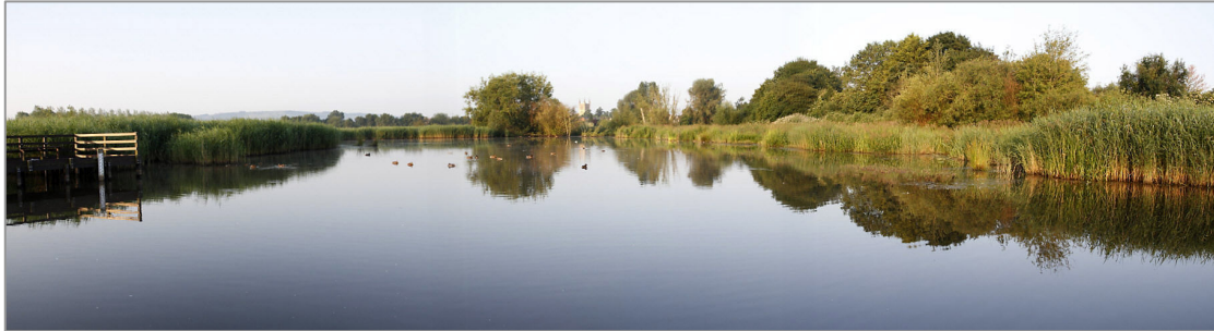
Fig.1: Real summer weather over the main pool. Taken just after sunrise on 7 July 2013. (R D E Stott)