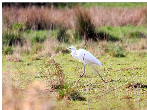
Fig.5: Great White Egret Egretta alba on the scrape area 27 April 2013. (R D E Stott)

Warbler , the only new species seen on the Wetland so far this year bringing our species total to 110.