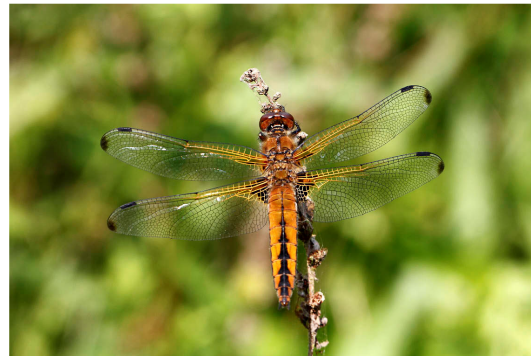
Fig. 10 Female Scarce Chaser occasionally seen beside drainage channels. (R D E Stott)