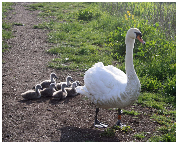
Fig.3: Our Mute Swan X60 in happier days with 7 cygnets taken during the All Day Birdwatch (see Recent Sightings below).