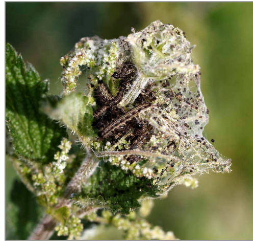
Fig. 8 Small Tortoiseshell caterpillars on the top of a stinging nettle on the Wetland in late June. (R D E Stott)

Work surveying butterflies started again this year on 1 April but it is only about now that butterfly numbers begin to rise and we can assess what sort of a year it will be. The 11 species recorded so far are the "usual suspects" including; Brimstone, Large, Small and Green-veined Whites, Orange-tip, Small Copper, Common and Holly Blues, Small Tortoiseshell, Peacock and Comma. This week butterfly numbers have begun to increase.