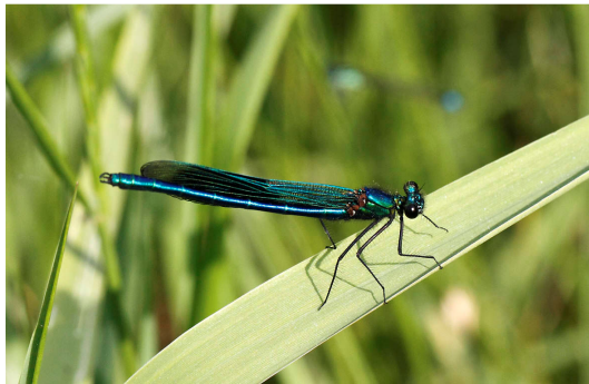
Fig. 9 Male Banded Demoiselle often seen by the river. Look out for the black patches in the wings.

We have made a start on a regular dragonfly survey this summer. As this is our first year of regular recording everything is new but exciting to find new ones even so. 6 species have been recorded so far during this year's survey.