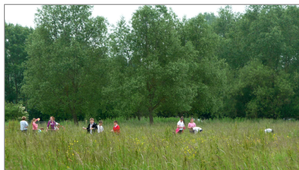
Fig.2: This is what the Wetland is for! Pupils from Holy Redeemer Catholic Primary School searching for bugs.

Catholic Primary School in Pershore visited the Wetlands in groups over a period of 2 days with Liz which was a very successful event.