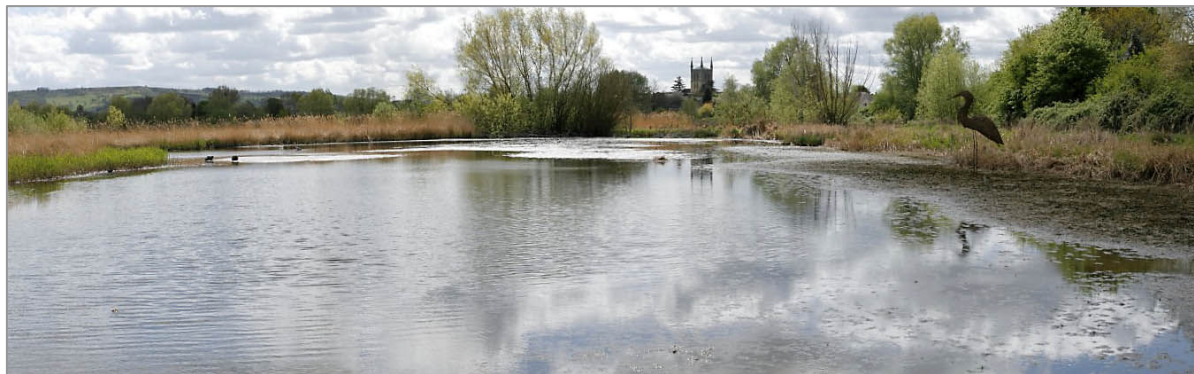
Fig. 1 Low rainfall has prevented the level of the main pool recovering since it was lowered for reed cutting in the winter.