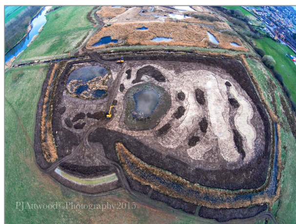
Fig. 3 The scrape looking south as it approaches completion

The excavation works needed to create the wader scrape are complete creating a series of islands and channels. Very many thanks to Severn Waste, our major sponsor for this work. The most interesting of original ponds within the scrape area has been left untouched to preserve its flora and fauna. It is now for Mother Nature to fill it with water and weather the soil to make it attractive to new species. We will be watching it carefully to see which species colonise it first.