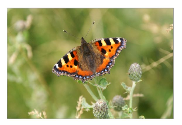
Figure 2: Small Tortoiseshell Aglais urticae taken on the Wetlands (K Pomfret)

Wychavon District Council and Pershore Town Council are jointly in the process of seeking Heritage Lottery Funding for a project to raise the profile of the Wetland. This would include appropriate signage in the town, together with a major initiative to involve local schools in the Wetlands. Events involving the natural history of the Wetlands for the benefit of local people are also under consideration, but it will be 2011 before we know if our application has been successful.