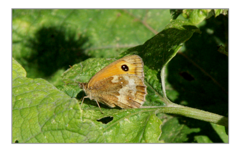
Figure 5: Meadow Brown Maniola jurtina & Gatekeeper Pyronia tythonus - check the number of white dots in the black spots on the forewing.