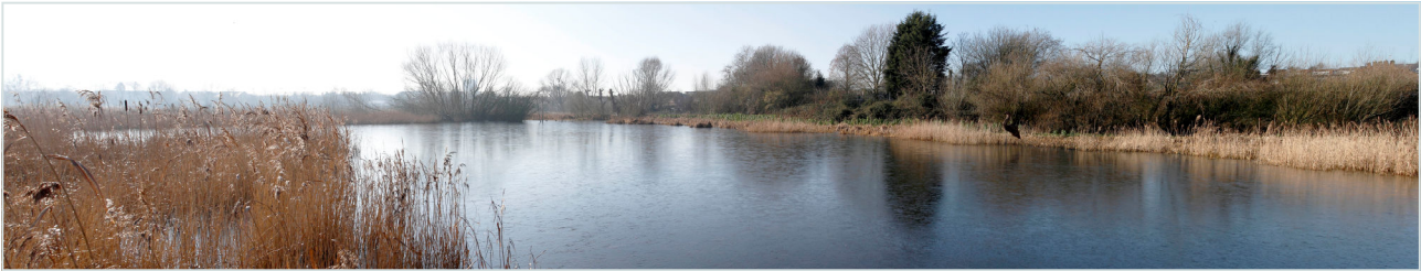
Thin ice on the main pool on 19 Jan 2016. With the ice present the water no longer provides safe refuge from land animals so the birds are scarce.