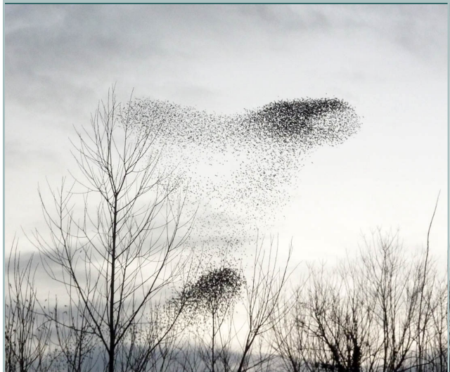
Starlings over Avon Meadows, January 2016. (see Murmurations below)