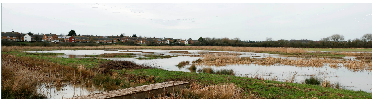
A view from the bird watching screen taken in late December of our wader scrape filling up nicely with water. It will take a couple of years to develop fully but already quite a number of birds are using it regularly.