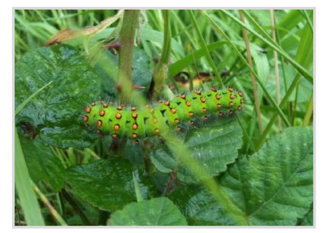
The caterpillar of an Emperor Moth photographed on the Wetland near the place where an adult was found in 2012.

Caterpillars of the Mullein Moth were found feeding on Figwort on the same day as the splendid caterpillar above.