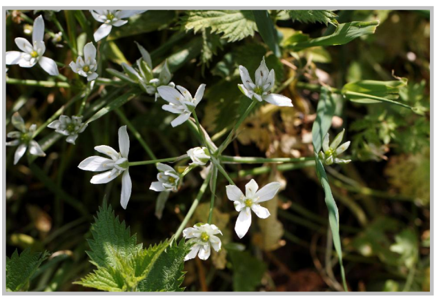
Greater Star of Bethlehem.

Tubular Water-dropwort is showing its white flowers in many of the water channels and wet areas of Avon Meadows. It is nationally classified as Vulnerable so our population is of concern. A recent survey of this species recorded >1400 plants making Avon Meadows an important site for this species.