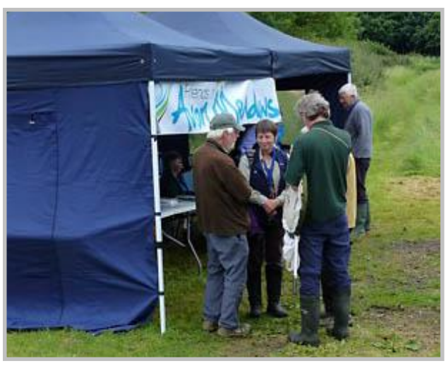
Preparations for the Bioblitz.