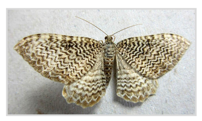
Scallop Shell moth.

Other insect groups have not fared so well in our changeable weather but moths are OK. We have added a number of new species to the Wetland list including, Oak Tree Pug, Waved Umber and Common Quaker, Scallop Shell (see below) and several micro moths.