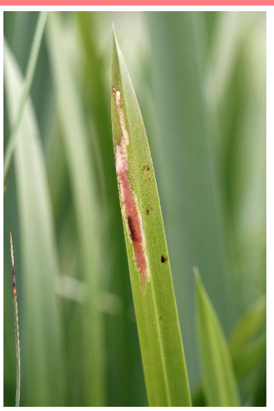
Leaf mine of Sweet-grass Dwarf micro moth.