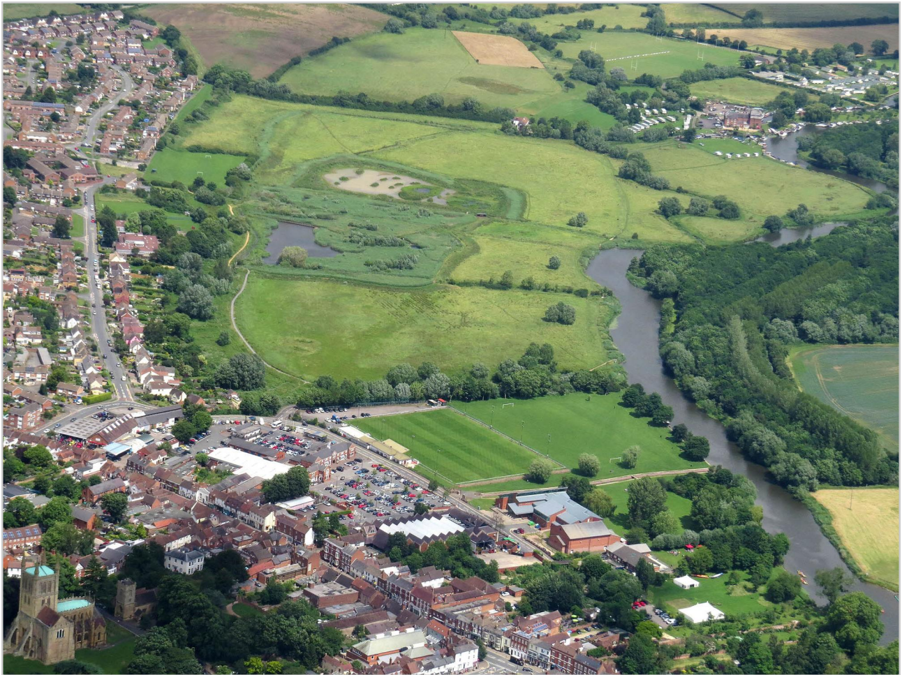
This photograph was taken from a light aircraft in June 2016. It provides an excellent view of the Wetlands with the River Avon to the right, Pershore High Street to the left and Pershore Abbey bottom left.