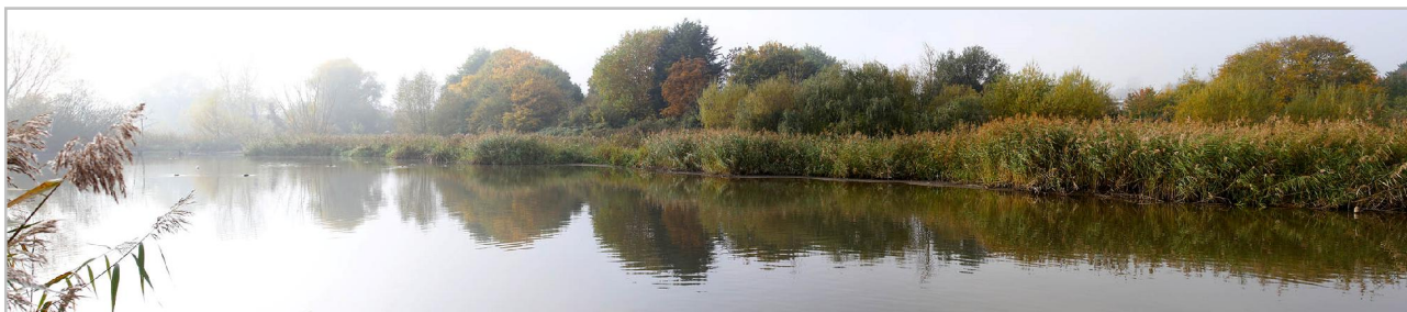
A misty autumn morning. The pool at its summer level to make it easier for cutting reeds.