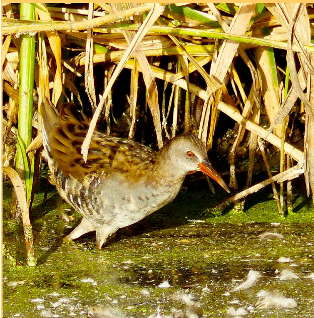
An excellent photograph of a Water Rail taken on the main pool recently in late morning light.