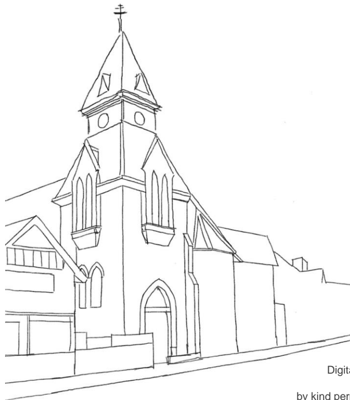
Digital sketch of Lopping Hall by kind permission of Jason Walton

In the short term, we will be replacing the curtains, erecting partition doors to contain the chairs and painting the skirting boards. The painting is a temporary measure to improve their appearance. This task is suitable for voluntary help. They will be stripped back and repainted as part of the main refurbishment.