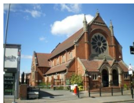
New Life Baptist Church, Kings Heath