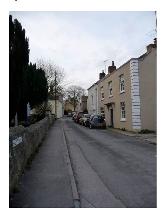
No. 20 High Street (Grade II)

Semi-detached house. Mid/late C18. Painted coursed stone with quoin bands, moulded stone cornice on low parapet, slate roof, brick end stacks. Single range with rear outshut, 2 storeys. 3 windows, 12-pane sashes in shallow reveals with keystone. Ground floor has one similar to right, triple sash to left and central doorcase with wide stone cornice on large consoles, raised triple keystone, 6-panel door, with 2-glazed, 2 fielded and 2 flush panels.