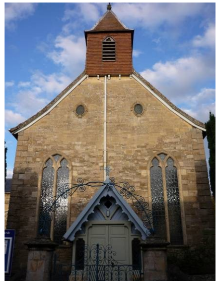
Description in the published listing

Anglican church. 1723, restored 1900. Coursed rubblestone on dressed stone plinth and ashlar-faced to west with chamfered alternating quoins, slightly swept tile roof with north transept roof in slate. Nave and continuous chancel and large projecting north transept. West end has C19 gabled porch with decorative timber work and barge board, flanking plain 2-light cusped lancet windows with 2 keyed oculi over.