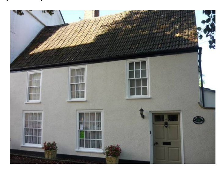
No. 10 High Street (Grade II)

Small house at end of terrace. Late C17/early C18. Rendered, double Roman tile roof, large rear brick lateral stack. Single range, 2 storeys. 3 windows, 12-pane sashes with flush moulded wood architraves. Ground floor has 2 wider 16-pane sashes in similar surrounds and door to right, in slight recess, of 6 fielded panels. Possibly partially timber-framed on first floor.