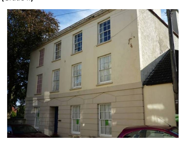
No.11 High Street (Grade II)

Large house at end of terrace. Mid C18. Stucco front on stone plinth with banded rustication on ground floor, render or roughcast sides, hipped concrete tile roof, tall rendered end stacks with moulded cornices. Moulded stone cornice and blocking course. Large square range, 3 storeys. 4 windows, 12-pane sashes (mostly replaced) in shallow reveals, bay to left being blind with imitation painted sashes. Ground floor has 3 similar windows with door to left of centre in bay 2 with 2 recessed and one flush panel and plain fanlight. Above each ground floor opening rustication channels form shape of pediment, with projecting stone plat band above.