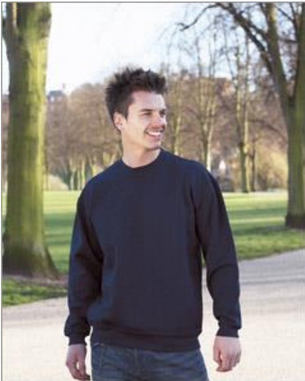
T SHIRT Code UC301 £10