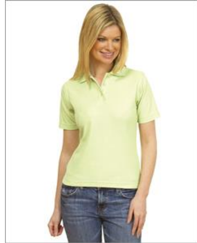
LADIES POLO SHIRT Code UC106 (shorter than UC101 and shaped) £15