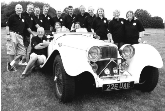
The Peppard Revels Committee

The weather for the whole weekend was pretty dismal but the Games went ahead as planned on the Saturday with around 30 families taking part. The tea time film Kung Fu Panda seemed to go down well with the kids. The Sunday Service with the Bishop of Dorchester attracted an amazing 300 people. The Monday evening Diamond Jubilee dinner was judged a success with nearly everyone on the dance floor by the end. The magnificent firework display ensured we were on the front of the Henley Standard .