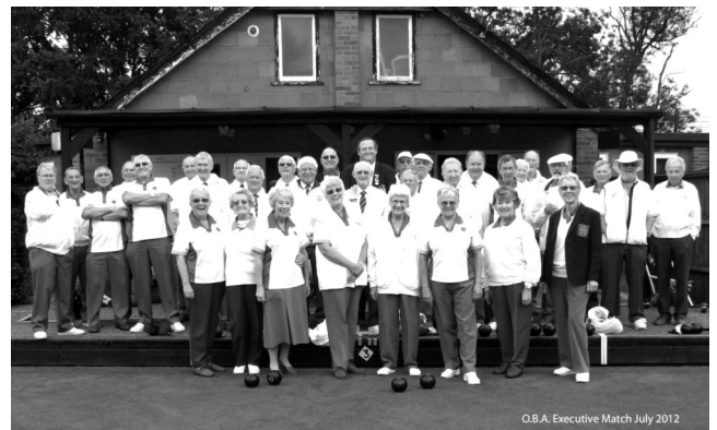
O.B.A. Executive Match July 2012

Our Club was selected to host an Oxfordshire Bowls Association executive match and also this year we hosted the Oxfordshire County semis and finals in three men's singles competitions.